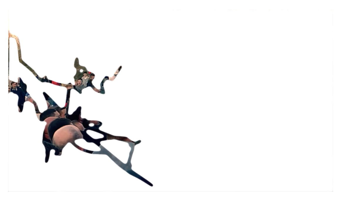
Figure 4: Anais Moisy, Jen Southern, Chris Speed and Chris Barker, Unruly Pitch, 2015.

photograph fashioned 'its own space around each band, framed by different surfaces, textures and juxtaposed objects'. These images were then 'randomly located by a computer program, to a contained space within a 3810mm by 1120mm frame' (2013). In so doing, Shepherdson explored how this arbitrary 'reappropriation' altered the prosaic and mundane nature of the materials and how 'surface, form and colour coalesce as viewing distance from the work increases' (2013). Next, Shepherdson fashioned the same one thousand rubber bands into a ball and set the object within a transparent resin container. As Shepherdson explains, these 'two interconnected works,...[open] up new research, making explicit connections between photographic images, surface, texture and three-dimensional installations'. Invested in capturing the simultaneous forming/performance of surface, Shepherdson's Band Apart presses Hookway's view that '[a] surface presents form, while an interface performs a shaping' (2014: 14).