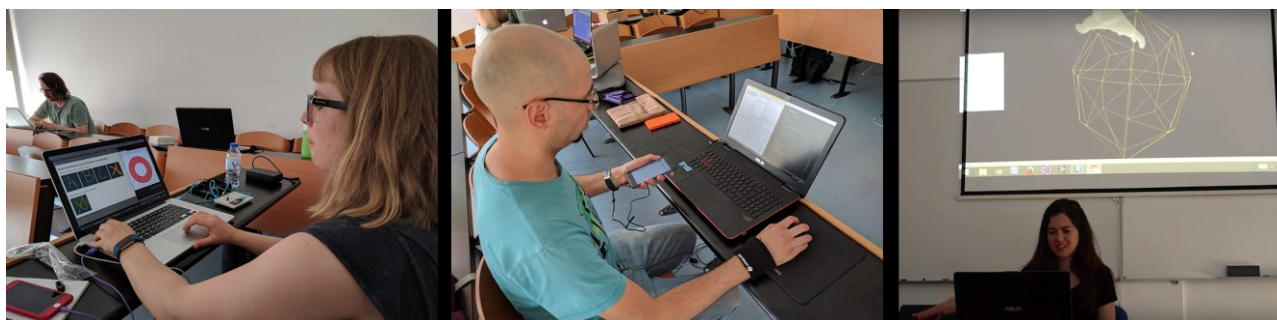
Figure 3 | a) and b) Participants working on their projects and c) presenting a final project.

piano. Technical and conceptual issues prevented the timely delivery of a fully functional hack.