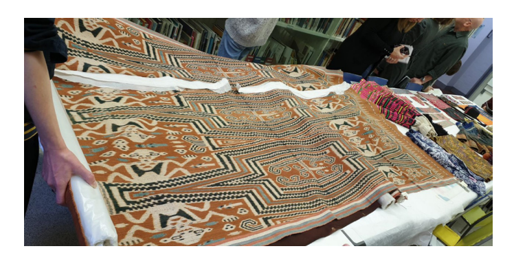
Figure 1. Ikat and other Southeast Asian textiles on display in the Goldsmiths Textile Collection's Constance Howard Gallery on 21 February 2019 Photo: Jorella Andrews. Reproduced with permission

Andrews, Jorella. Erasure and Epoché: Phenomenological Strategies for Thinking in and with Devastation. In ISSUE 08: Erase. Singapore: LASALLE College of the the Arts, 2019. pp. 69-79.