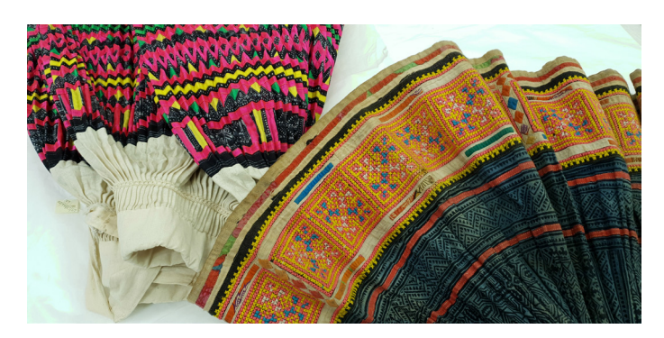
Figure 3. Details of two Hmong wrap skirts on display in the Goldsmiths Textile Collection's Constance Howard Gallery on 21 February 2019 Photo: Jorella Andrews. Reproduced with permission

As already indicated, my aim in this essay is not to undermine scholarly attempts at retrieving lost context and meaning within scenarios marked by erasure. Rather, I wish to propose an additional and alternate approach that moves not from a devastated present to a lost past but, operating outside of a logic of melancholy, across different trajectories of the present with an eye to the future. Here, the aim is to stay with the remains and to ask how, if we will let them, objects affected by erasure may function as teachers out of their particular qualities of what-ness, here-ness, and now-ness. How might 'these' aspects of their being 'be allowed' to take on new meaning, legacy and agency, provoking us to see, think and act differently and to reach out into the not-yet-known? At issue here is their capacity to inaugurate these new possibilities in concrete, material ways.