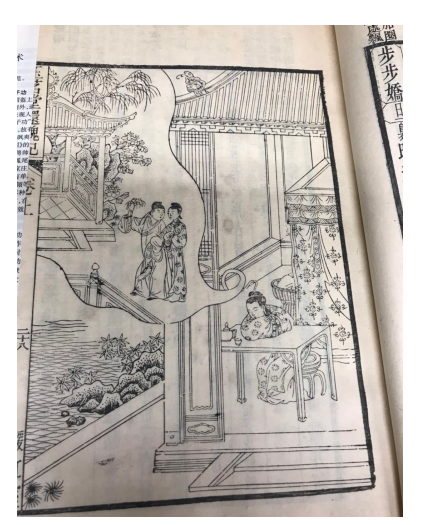
Figure 1.7 An Amazing Dream, The Peony Pavilion, published by Ye Shi Nan Shu Ying in Qing Qianlong renzi [57 nian, 1792], this book was included in the SOAS Library.