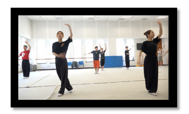
Figure 1.6 Actors training in the morning at Suzhou Kunju Theatre, picture was taken in July 2017

During the video of the young actors' exercises at Suzhou Kunju Theatre in the morning, movements for stamina training were included in chuan shou, shuan yao , dao shou, shuang fei yan, wo yu, sao tui and pao yuan chang.