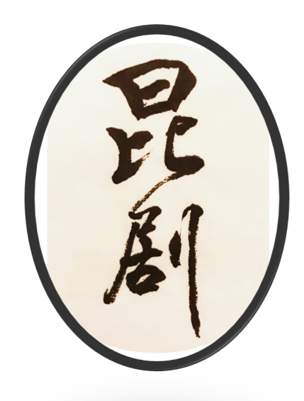
Figure 1.4. Chinese Calligraphy "Kun Ju" by Yang Zaichun (1943-), Dec. 2017