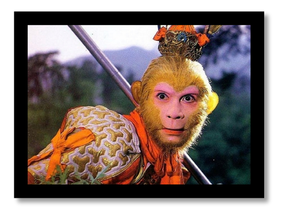
Figure 2.4 Liu Xiao Ling Tong playing the Monkey King in Journey to the West

Tong benefited from the rich heritage of the opera, and his performance comes from life and is higher than life.