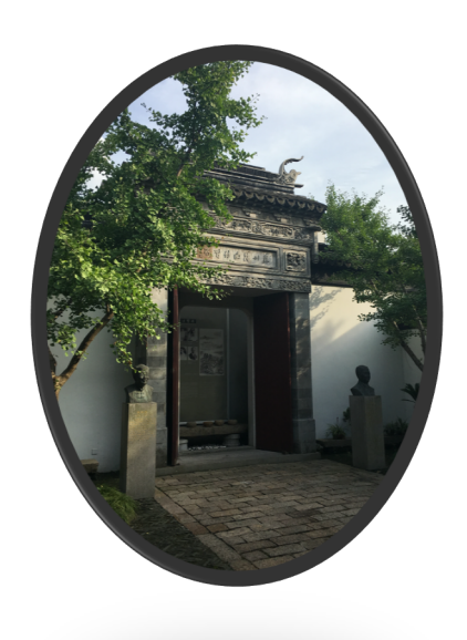
Figure 1.5. Kunju Chuan xi Suo site opposite the Suzhou Kunju Theatre, picture was taken in July 2017

In order to cultivate the performing talents of people from all walks of life, the Kunqu Opera School (in Chinese: Kunju Chuanxi Suo) was established in Suzhou to teach Kunju in 1921. Today, in order to protect influential Chinese opera music, the United Nations has included Chinese Kunqu opera on its intangible cultural heritage list. As some performance techniques in Kunju have been passed onto other types of opera, it is important to preserve the singing style of Kunqu for future generations. When concepts develop, the product of this development is based on the original concept, so it is understandable that Kunju theatre includes elements of Kunqu opera. In the reference book The Chinese Kunqu Dictionary , published by Nanjing University, the title in Chinese characters uses the term Kunju but in English, it is Kunqu, which proves that Kunju theatre includes Kunqu opera (Wu, 2001). Kunqu opera is a singing form of Kunju theatre; the development of the physical actions of Kunju theatre is obvious in Beijing opera. Beijing opera performances became much more improved after Mei Lanfang recommended that actors study Kunju theatre techniques.