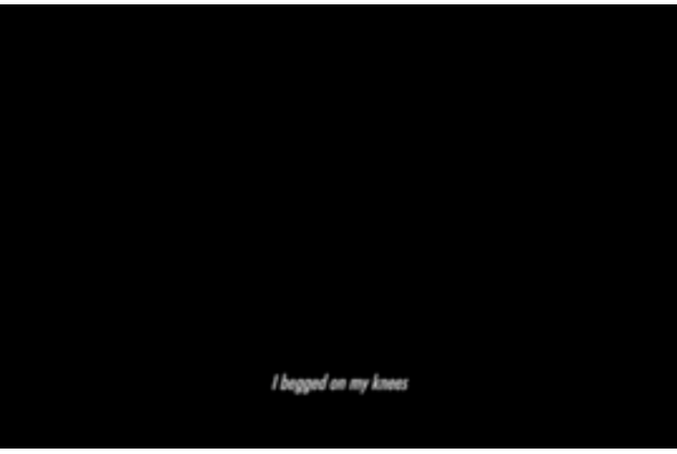
Fig. 4 The black screen, The Milk of Sorrow (Llosa, 2009)

The eyes of the viewer run over the screen in search of a clue, or something to make sense of the void.