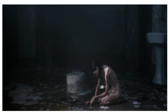
Fig. 3 Zarin kneels on the floor, Women Without Men (Neshat, 2009)