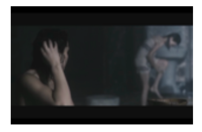
Fig. 1 Zarin in the bathing house, Women Without Men (Neshat, 2009)

of the camera (which zooms in on Zarin), and in the lighting that contrasts the brightness of Zarin's skin with the darkness of the background. As previously mentioned, the camera's stasis also contrasts with the harsh brushing, as we see Zarin's hands move frenetically back and forth across the frame. This again importantly reveals the urgency to move beyond Irigaray's suggestion that the caress with oneself can only be considered peaceful and respectful. For, if the caress is to be fully considered as an embodied, lived experience of woman, then we must acknowledge that the caress can also be violent.