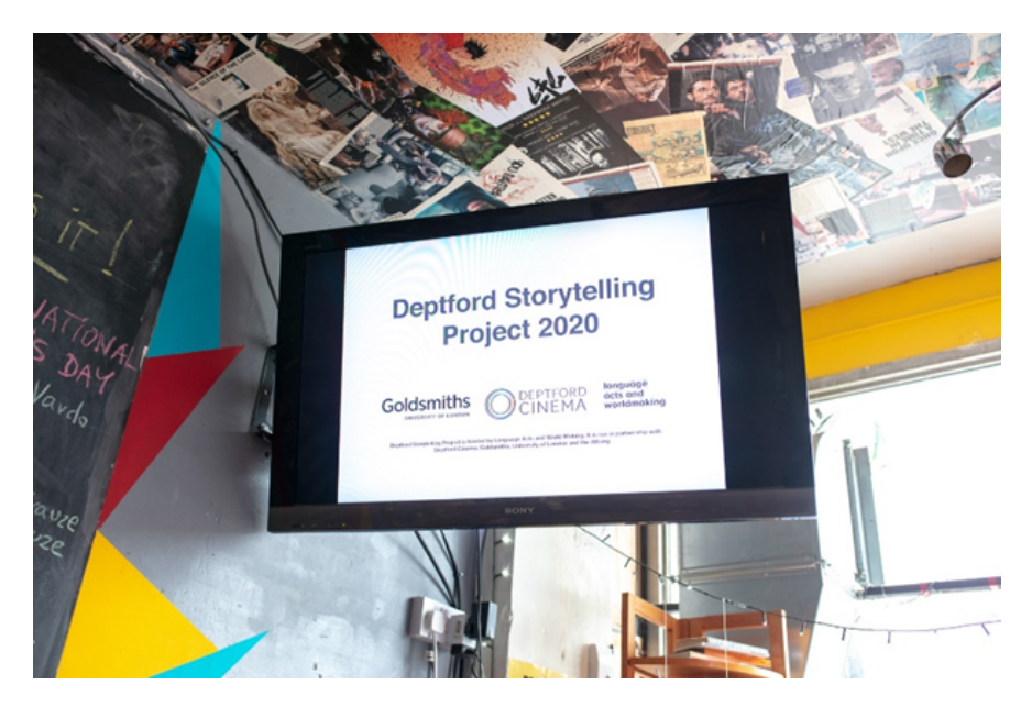
Public Event at Deptford Cinema, Deptford, London

Centre for Language, Culture and Learning, Goldsmiths, University of London