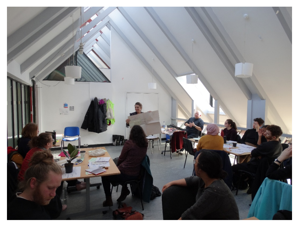
Pre-production workshop on storyboarding and scripting at the Albany