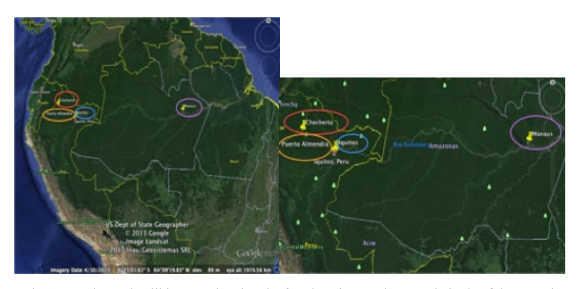
Fig 1. Google Earth still images showing the four locations at the same latitude of the Peruvian and Brazilian Amazon where the MHC team sampled microbial DNA. From West to East (in a gradient of transculturation—less to more westernised): huts of isolated Achuar villages (Checherta); rural settlement of an Amerindian-mestizo town (Puerto Almendros), mestizo cities (Iquitos), and mestizo modern buildings (Manaus).

Between 2013 and 2017, I conducted ethnographic fieldwork of a microbial ecology study, entitled "Microbiomes of Homes across Cultures" (MHC), looking at changes in microbial patterns and changes across an evolution of lifestyle, from less to more "westernised" modes of living attending to urbanisation, diet and medicalisation among other sociocultural elements and characteristics of lifestyles. The scientific team I followed consisted of microbial ecologists and other scientist coming from diverse fields including architecture, environmental engineering, and anthropology. They conducted two main expeditions (2012 – 2014) structured around four locations at the same latitude of the Peruvian and Brazilian Amazon (see Figure 1) and sampled microbial DNA from the environment (air, surfaces of objects), human and non-human animal bodies.