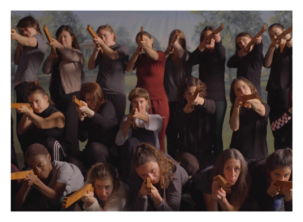
Fig. 4. Olivia Plender, Hold Hold Fire , 2019. Video, 11 min. 36 sec., still. Reproduced by kind permission of the artist.

represented in some heroic painting ... There's no equivalent genre that that would heroically celebrate a woman struggling with bad housing conditions; living as a single parent with three jobs, none of which pay her adequately to support herself and her family.