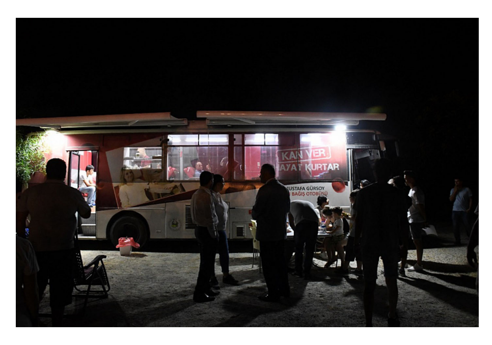
FIGURE 3 Blood donation centre at the back of the event area.

The role of blood donation in commemorative rituals has been analysed extensively by anthropologist Jacob Copeman in the context of India (Copeman, 2004, 2009). Copeman shows how blood donation campaigns are part of political party rituals that commemorate deceased leaders, especially as part of the contemporary Nehruvian campaigns for 'national integration' across caste and ethnic differences. Copeman argues that blood donation is conceptualised as a 'difference-traversing gift' in Nehruvian secular nationalism: this is because the anonymity of the relationship between the donor and the recipient means that each blood transfusion has the potential to cross ethnic and caste boundaries and link persons to each other as Indian nationals. Blood is also very central to Turkish nationalist narratives and politics in Cyprus, but very often as a symbol and metaphor: indeed, in Turkish nationalist discourse in Cyprus, as