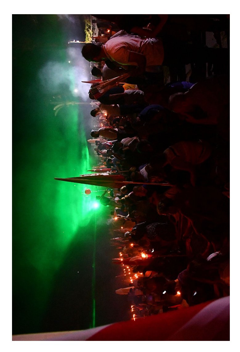
FIGURE 5 Participants as they 'keep watch' on the beach.