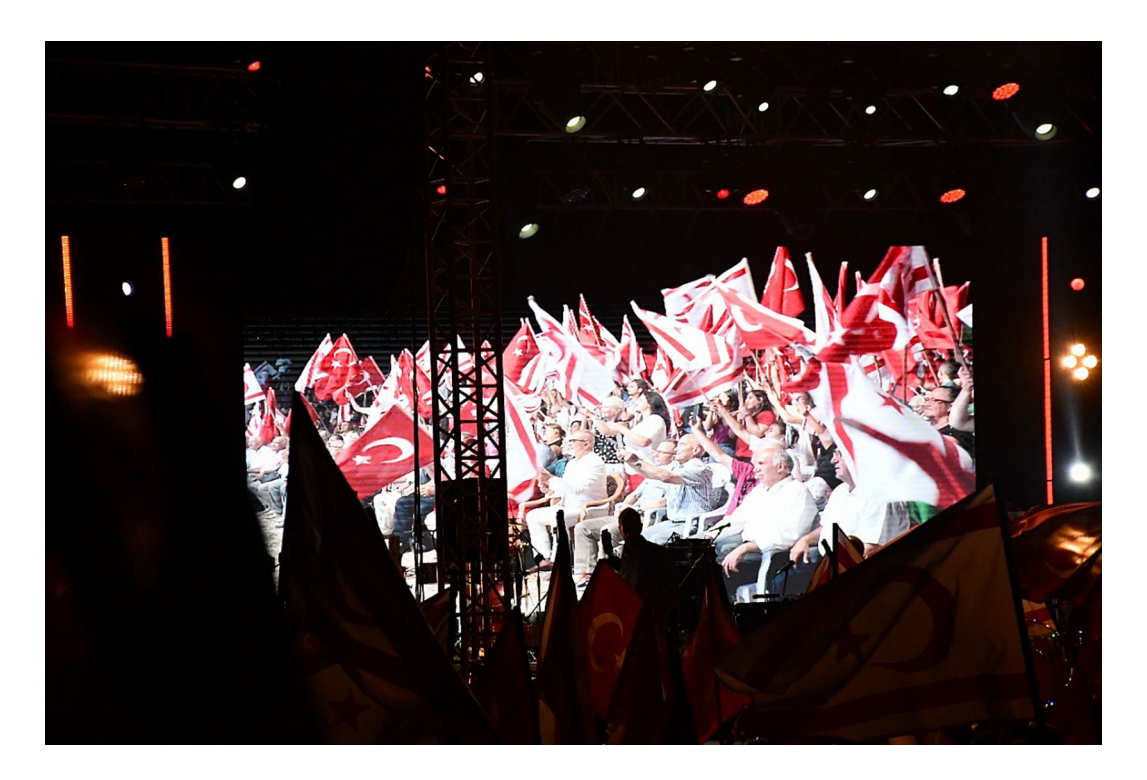
The participants projected back to themselves on the main stage.

Between each of these recorded footages, the professional presenter on the stage urges the crowd to wave their flags ever more enthusiastically by addressing the participants as 'Dawn Guards' (Şafak Nöbetçileri). When unsatisfied with the level of enthusiasm demonstrated by the commemoration participants, who are largely a literal 'audience' at this stage of the event, the presenter often takes the initiative and stops the procession of recorded speeches until the participants demonstrate greater fervour through their cheers and flag waiving. The cameras which broadcast the Dawn Watch live on social media occasionally point towards the crowd and project the participants' images on the large screen on stage, and thus, back to themselves