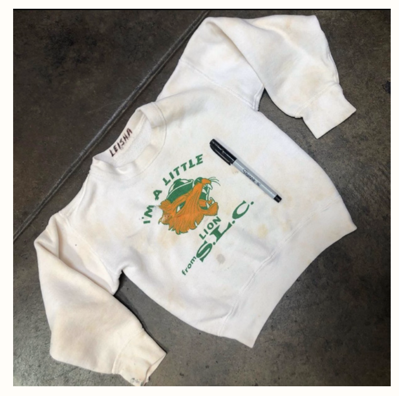
Sharpie and vintage child's sweater (2019).