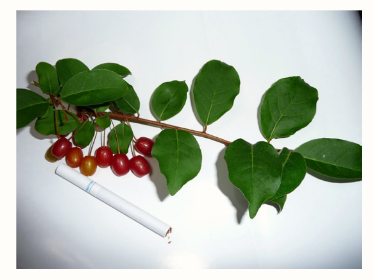
Cigarette and Japanese silverberry (2008). Image via Namazu-tron, Wikimedia Commons.