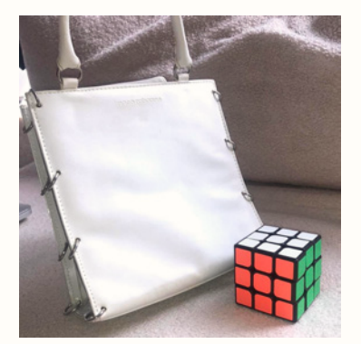
Rubik's Cube and bag (2023).