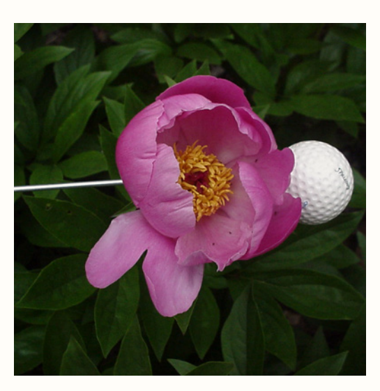
Golf ball and peony (year unknown).