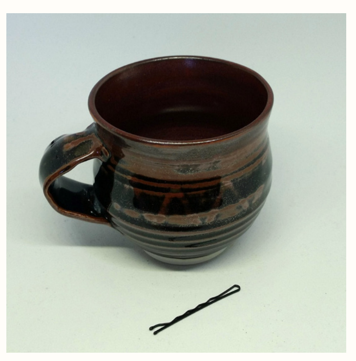
Hair grip and mug (2019).

Would a CD still be recognised by gen Z? Many of the sizegivers I've found seem to be threatened by obsolescence in one way or another: pencils and paper replaced by laptops; batteries replaced by charging leads; cigarettes, matchsticks, matchboxes and lighters replaced by vapes. Technology is changing fast. Smartphones, cameras and other devices can't be sizegivers because they update and re-edition faster than they can become familiar. Which everyday objects will become relics of the past, and which will be sizegivers in the future, I wonder? Which timeless, common things will connect my generation with the everyday reality of the next? What objects will live in our pockets in 30 years time? END