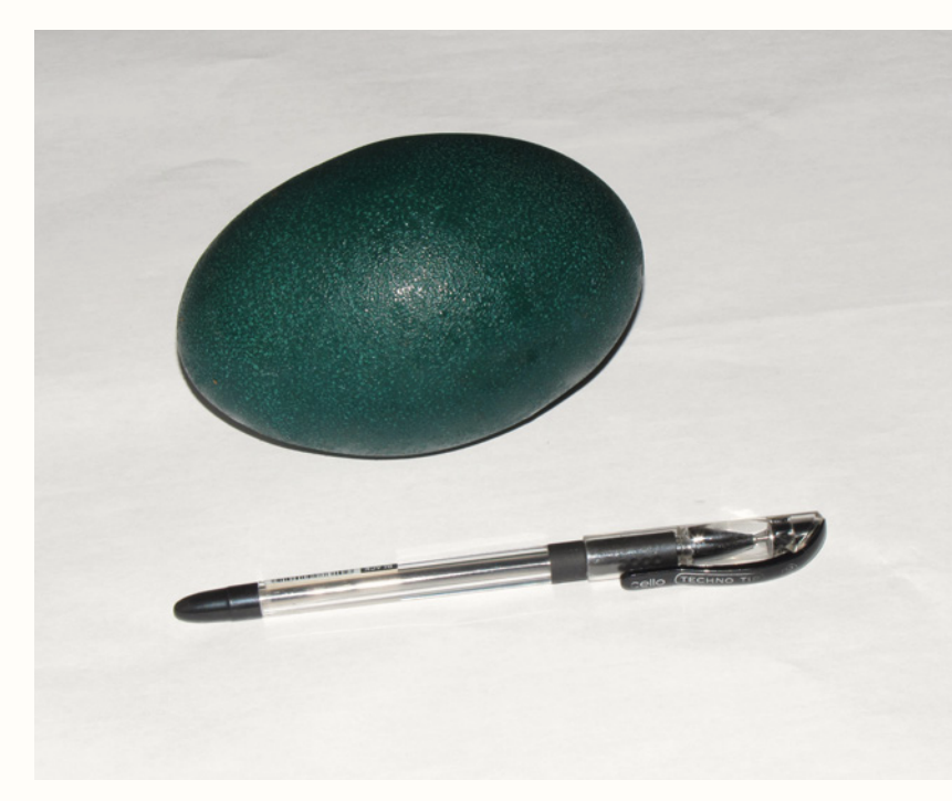
Pen and emu egg (2015).