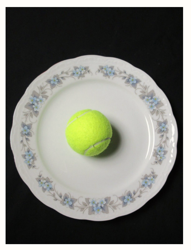
Tennis ball and Bavarian plate (2023). Image via chris_wain, eBay.