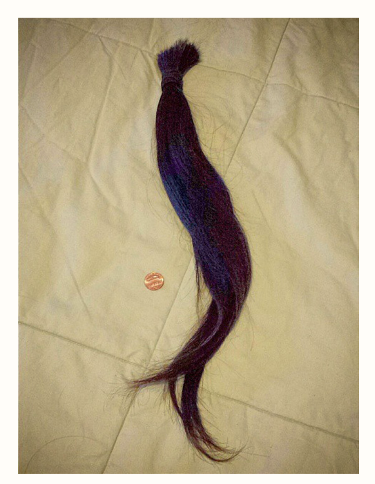
Coin and hair donation (2015).