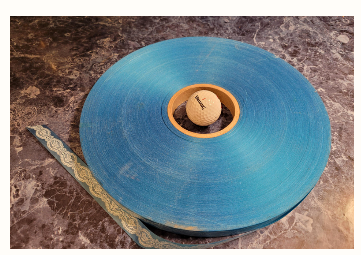
Golf ball and ribbon reel (2023).