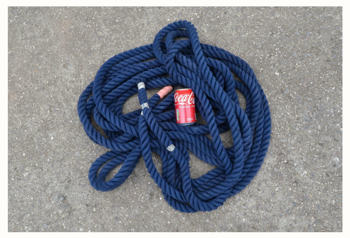
Coke can and mooring rope (2022).

one yellow as a pumpkin, one red as a tiny cherry, one is chocolate-coloured, one black with a white stripe, one green with spots in a different green, one grey and black, one gleams as if it contained fragments of glass; so many little stones no larger than a five lire coin.