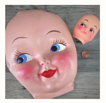
Coin and dolls' heads (2018).