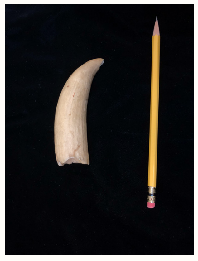
Pencil and sperm whale tooth (2019). Image via Akrasia25, Wikimedia Commons.