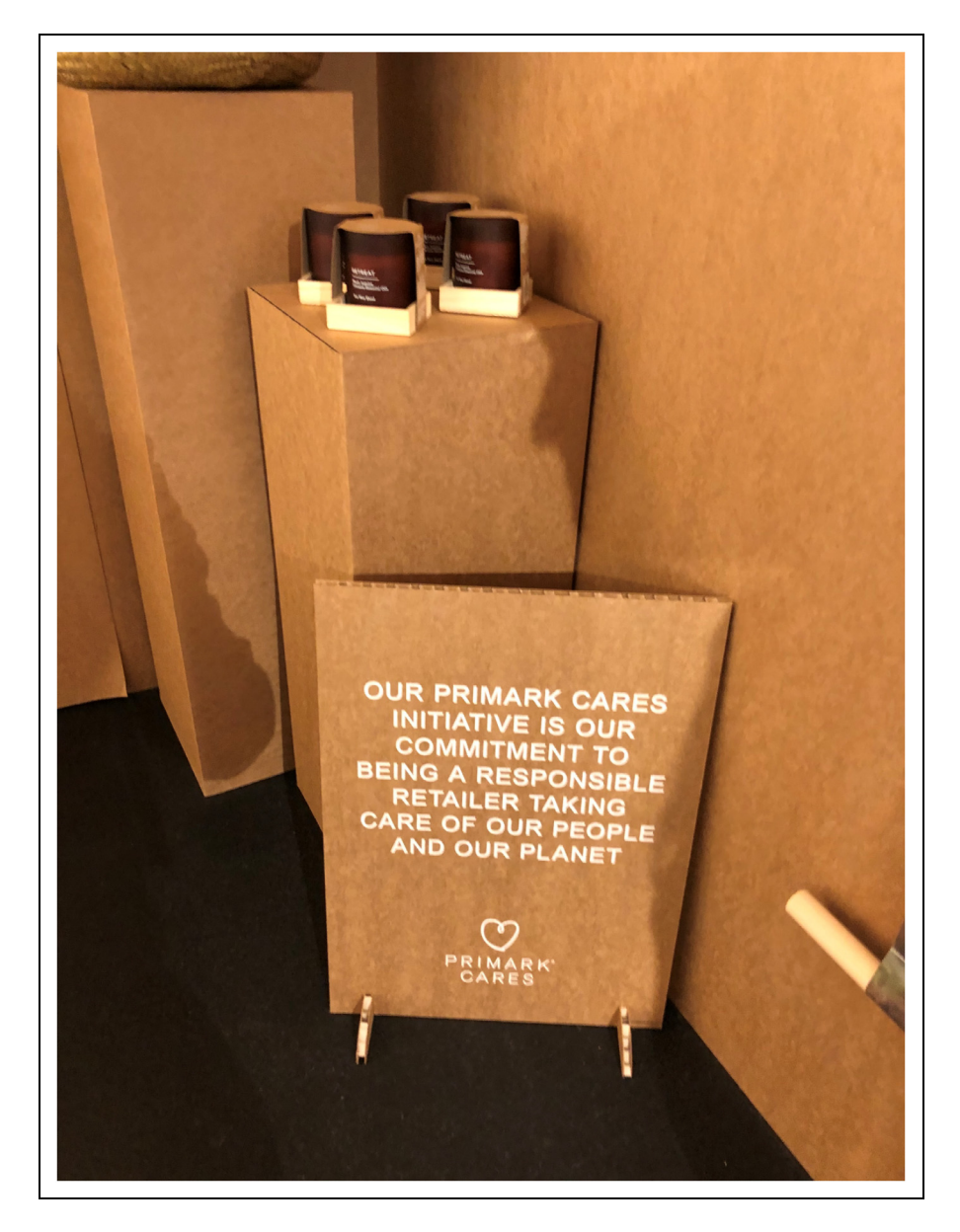
Figure 3. 'Primark cares' display.

Such extreme forms of carewashing did not simply arrive with the pandemic; they had been rehearsed beforehand. Just before the beginning of the pandemic, for example, Primark, a company that is emblematic of fast fashion and the throwaway consumer