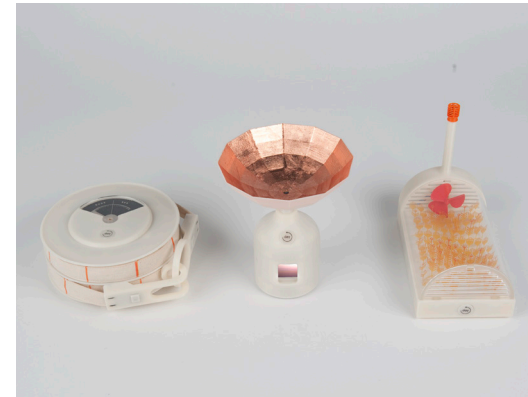
There are three Indoor Weather Stations: the Temperature Tape, the Light Collector and the Wind Tunnel.

Left : The Light Collector displays the ambient light in the home as a continuously updating colour palette.