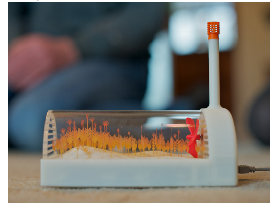
The Wind Tunnel senses micro drafts and amplifies them within a miniature landscape.