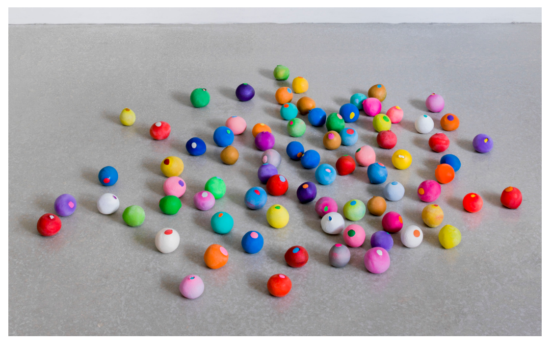
Claire Fontaine, Untitled (Corps étranger), 2017. Latex balloons, plastic bags, hempseed, yellow and red millet, linen seeds, canary seeds, and whole oats. Eighty-one individual elements, dimensions variable.

Water as a medium of storytelling and archive finds further resonance in Deborah Ligorio's Care: A Somatheory Encounter (2017). The work comprises a video and an installation in which