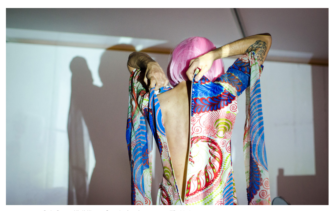
Raju Rage, Visibility or Opacity (performance still), 2016. PHOTO: TIU MAKKONEN. COURTESY THE ARTIST.

Deborah Ligorio, A Somatheory Encounter: Relational Objects , 2017. Mixed media, dimensions variable. COURTESY THE ARTIST.