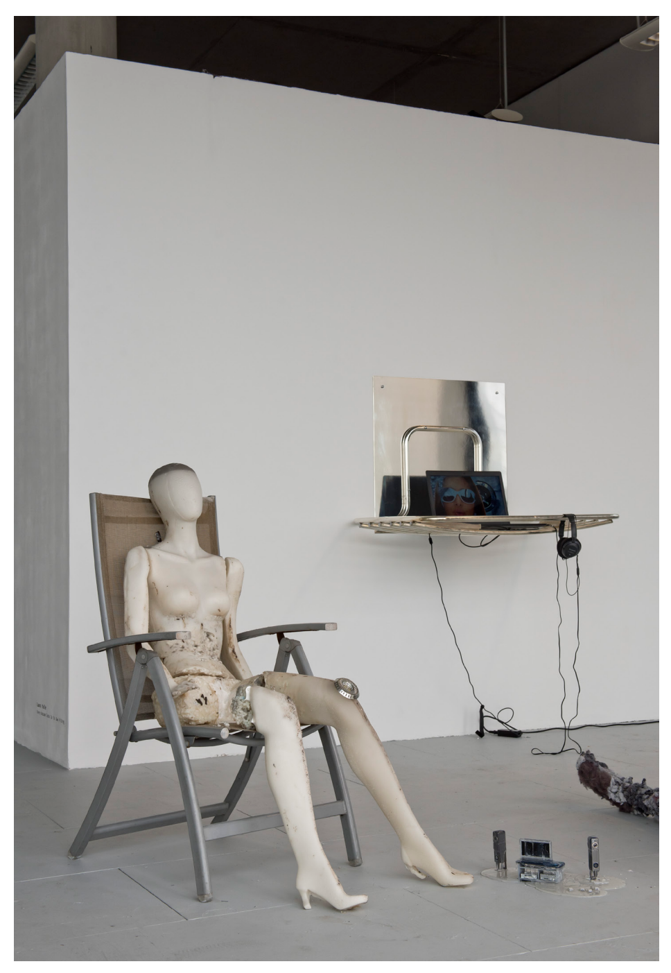
Laura Yuile, Mother Figure #1 and Public Feature (installation view), 2017. Steel, chrome paint, laptop, digital video, soap, eucalyptus oil, dirt hand-picked from "The Street," Stratford, Westfield, London, small hi-fi system, small "home" decorative wooden word blocks, glass wax.