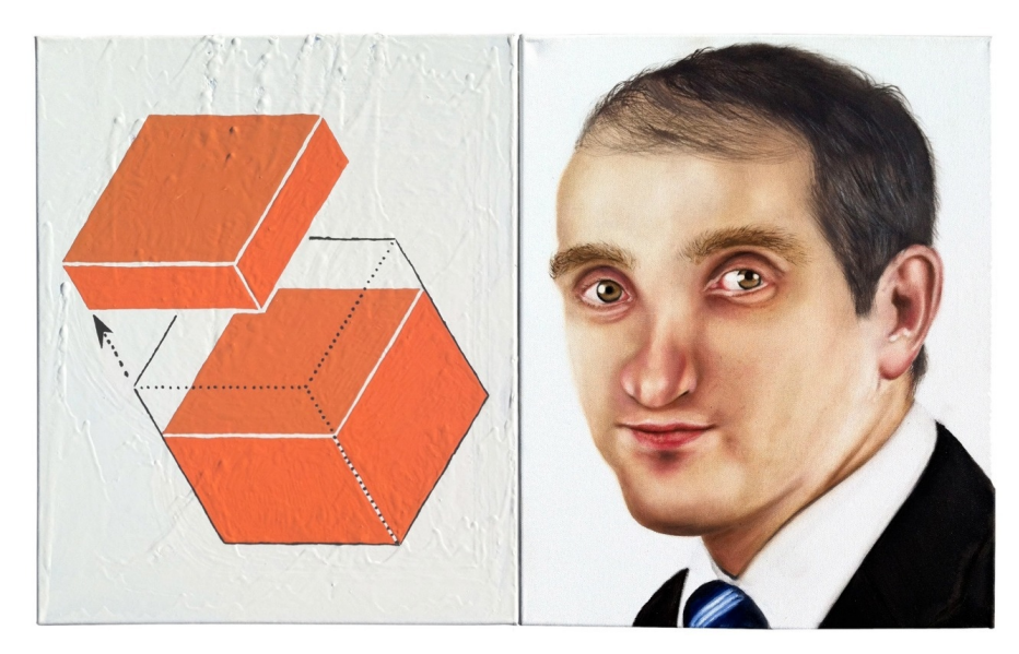
Figure 2. Amir Chasson, Ten dimensional tetrahedron , oil and household paint on canvas, 2011.

Figure 1. Erica Scourti, Life in Adwords (screenshot view), 2012-2013