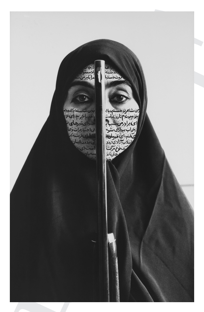
Figure 3.5 Rebellious Silence , Shirin Neshat, 1994. RC print & ink, 118.4 x 79.1 cm. Photo by Cynthia Preston. Copyright Shirin Neshat. Courtesy the artist and Gladstone Gallery, New York and Brussels.

represent to both Iranian exiles and western commentators. These women figure as silent, militant and confined subjects as Neshat's depictions work with 'four symbolic elements...: the veil, the gun, the text, and the gaze'<sup>42</sup> to unsettle how we, the viewer, see these