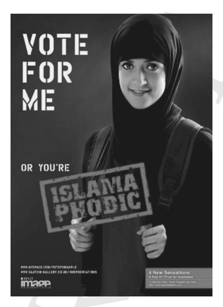
Figure 3.2 Vote For Me, Sarah Maple, 2007. Courtesy of the artist.

Muslim womanhood. Maple sees her 'art [as] a form of activism'<sup>38</sup> as she combines a feminist politics with references to life as a young, Muslim woman growing up in the predominately non-Muslim southeast of the UK.