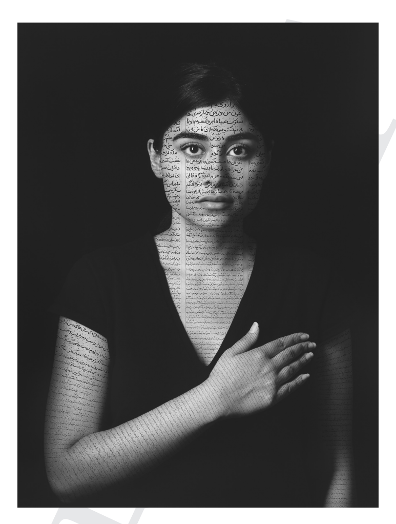
Figure 3.7 Nida (Patriots) , from The Book of Kings series, Shirin Neshat, 2012. Ink on LE silver gelatin print, 152.4 x 114.3 cm. Copyright Shirin Neshat. Courtesy the artist and Gladstone Gallery, New York and Brussels.

The seriousness of Neshat's work – no attempt at humour or irony here – underscores how expat as well as Western-born Muslim women artists are engaging in a