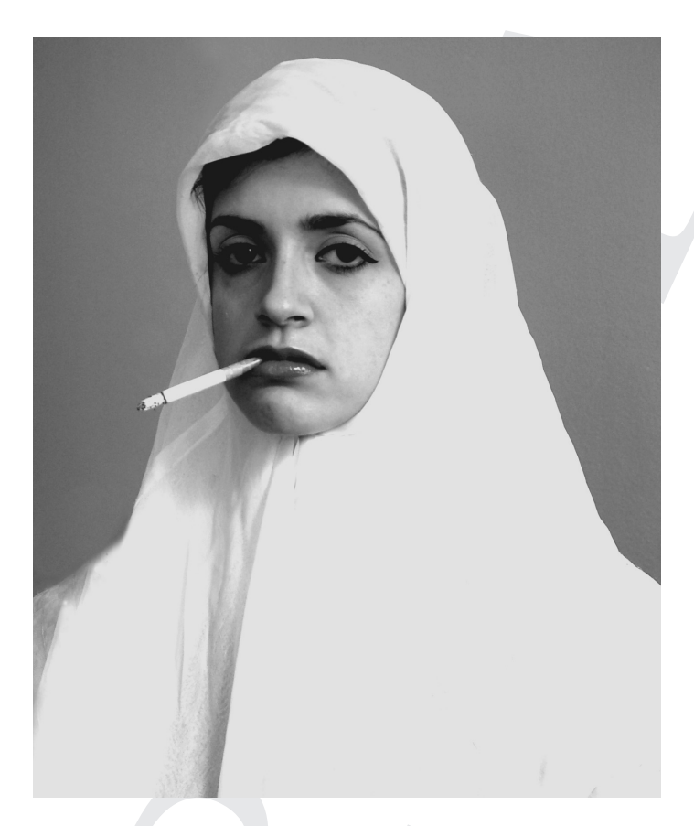
Figure 3.4 Fighting Fire With Fire, Sarah Maple, 2007. C-type. Courtesy of the artist.

at other Muslims and speaking to other Muslims, they look at the religion very differently than I do. And what I perceive to be a good Muslim isn't what other people perceived. 40