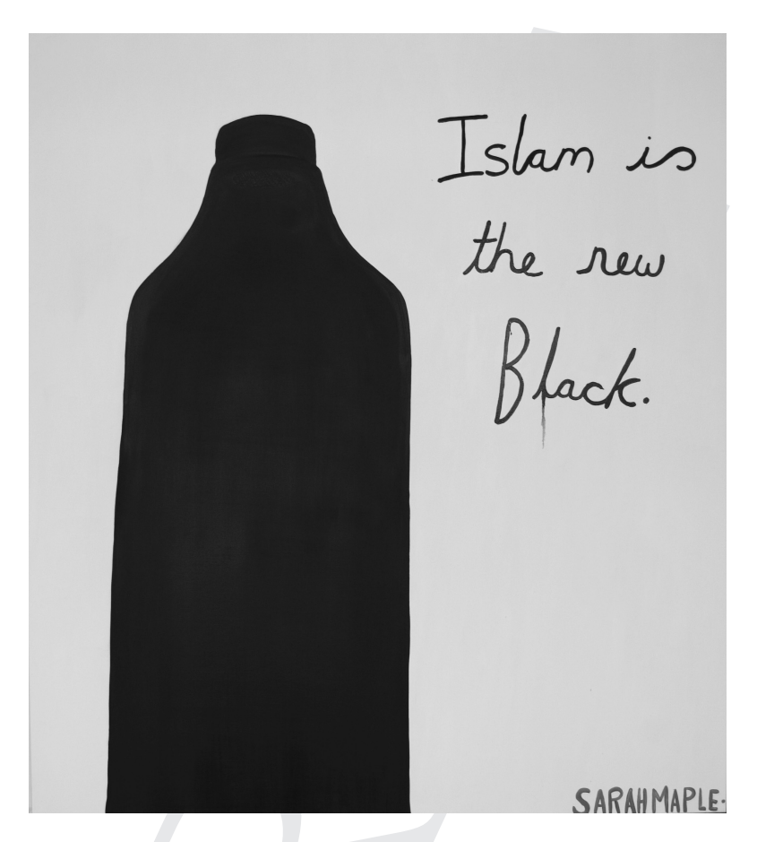
Figure 3.3 The New Black , Sarah Maple, 2007. Oil and acrylic on canvas, 190 x 170 cm.

discursively racist and culturally reductionist media stereotypes of Islam.<sup>39</sup> Maple acknowledges here that a