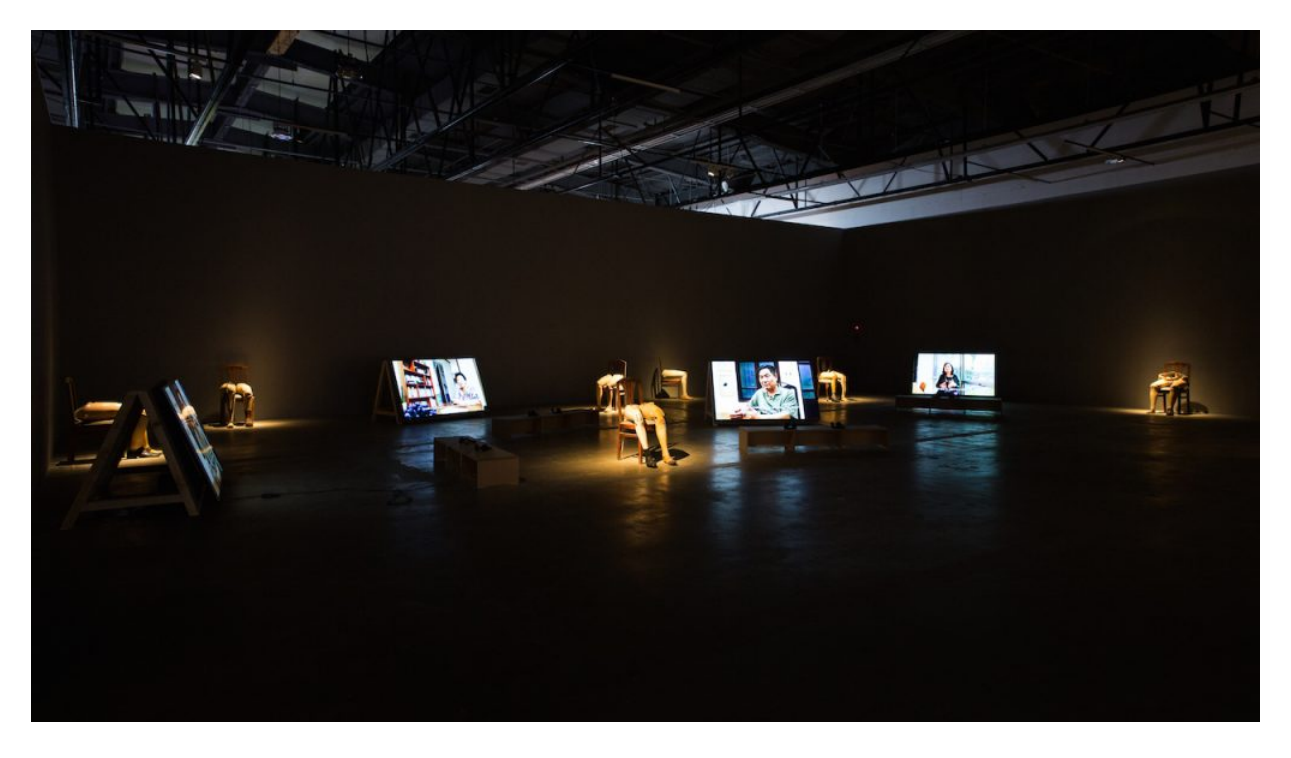
Kader Attia, Shifting Borders , 2018. Mixed Media Installation; chairs, prosthetic legs, shoes; 3 channel HD digital film projection on 4 screens: "Recycling Colonialism", "The Paradoxes of Modernity", "Catharsis: The Living and The Dead Are Looking for Their Bodies". Installation view at the 8th Gwangju Biennial, GB Galleries, Gwangju, Korea, 2018.

In our final session we will again draw together a number of workshop themes and threads. On the one hand, we will explore how the work we have done with respect to the ASEAN objects in the GTC might be developed to contribute to the GTC resources. On the other hand, we will also consider relationships between the workshop themes and our own current research, and further plans.