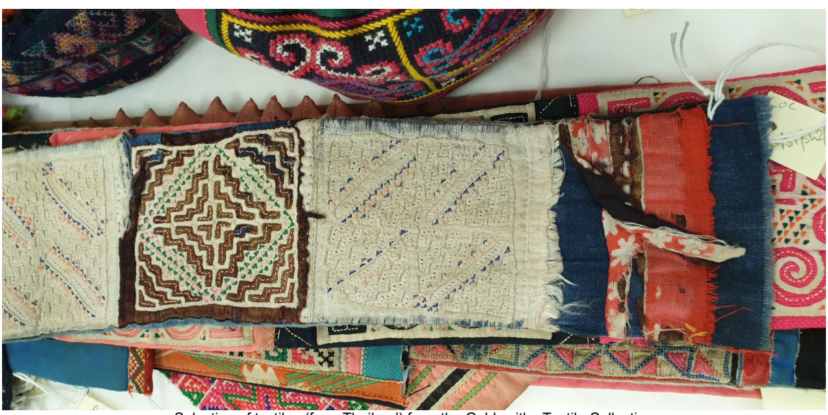
Selection of textiles (from Thailand) from the Goldsmiths Textile Collection