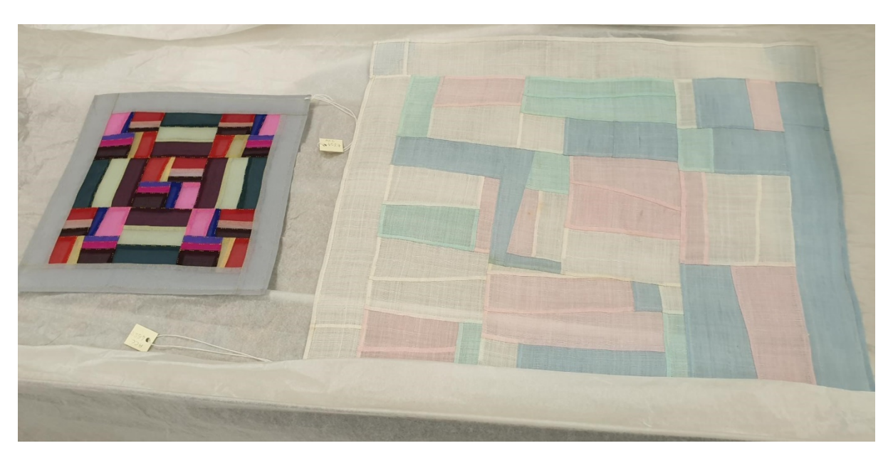
SE Asian items from the Goldsmiths Textiles Collection