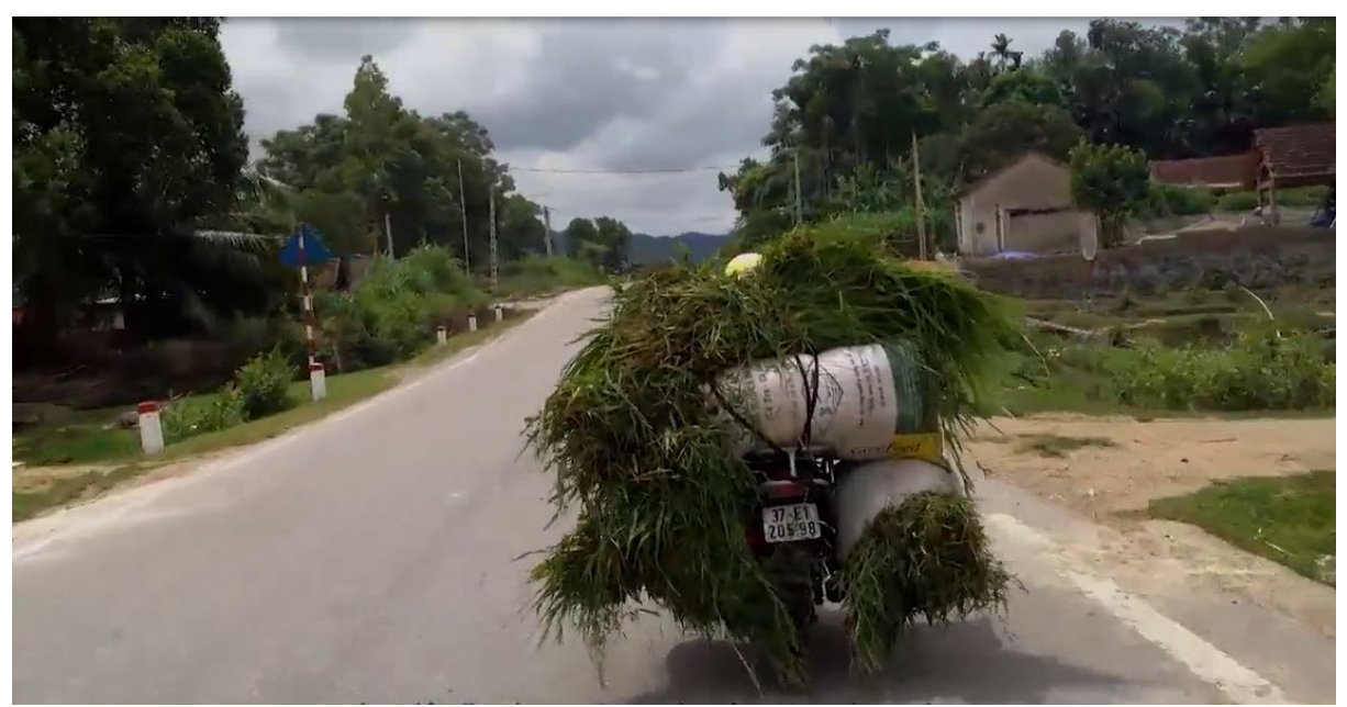
Still from: Hguyen Trhinh Thi, Letters from Panduranga (2015) Single-channel video, color and b&w, sound, 35:00.