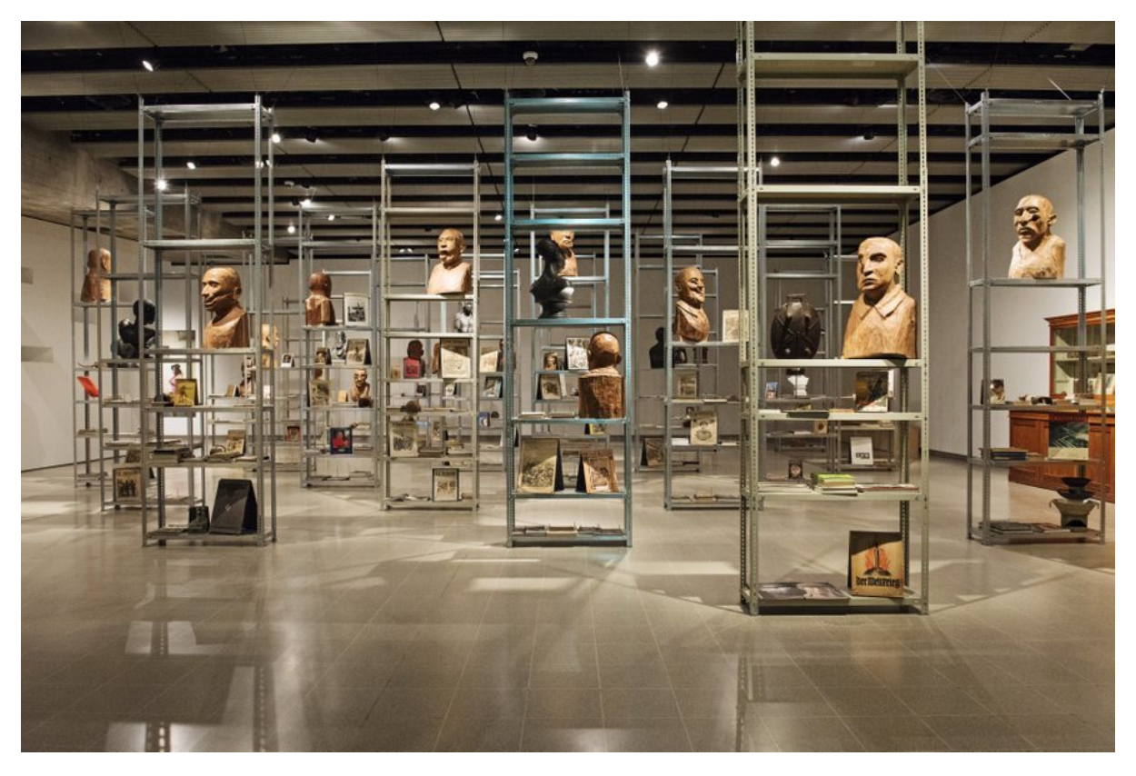
Installation shot: Kader Attia, Museum of Emotion, Hayward Gallery, 2019