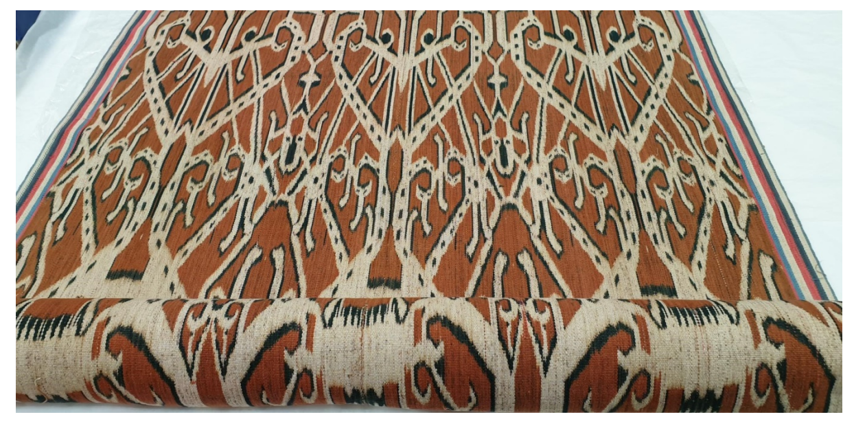
Indonesian ceremonial textile Ikat; Borneo, possibly woven in Sarawak. Goldsmiths Textile Collection.