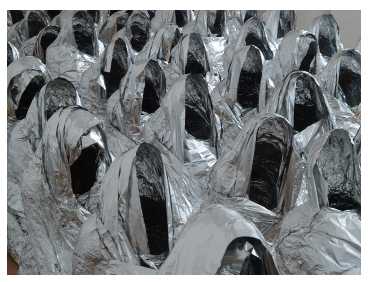
Kader Attia, Ghost, 2007, Aluminium foil, dimensions variable. Installation view, Saatchi Gallery.