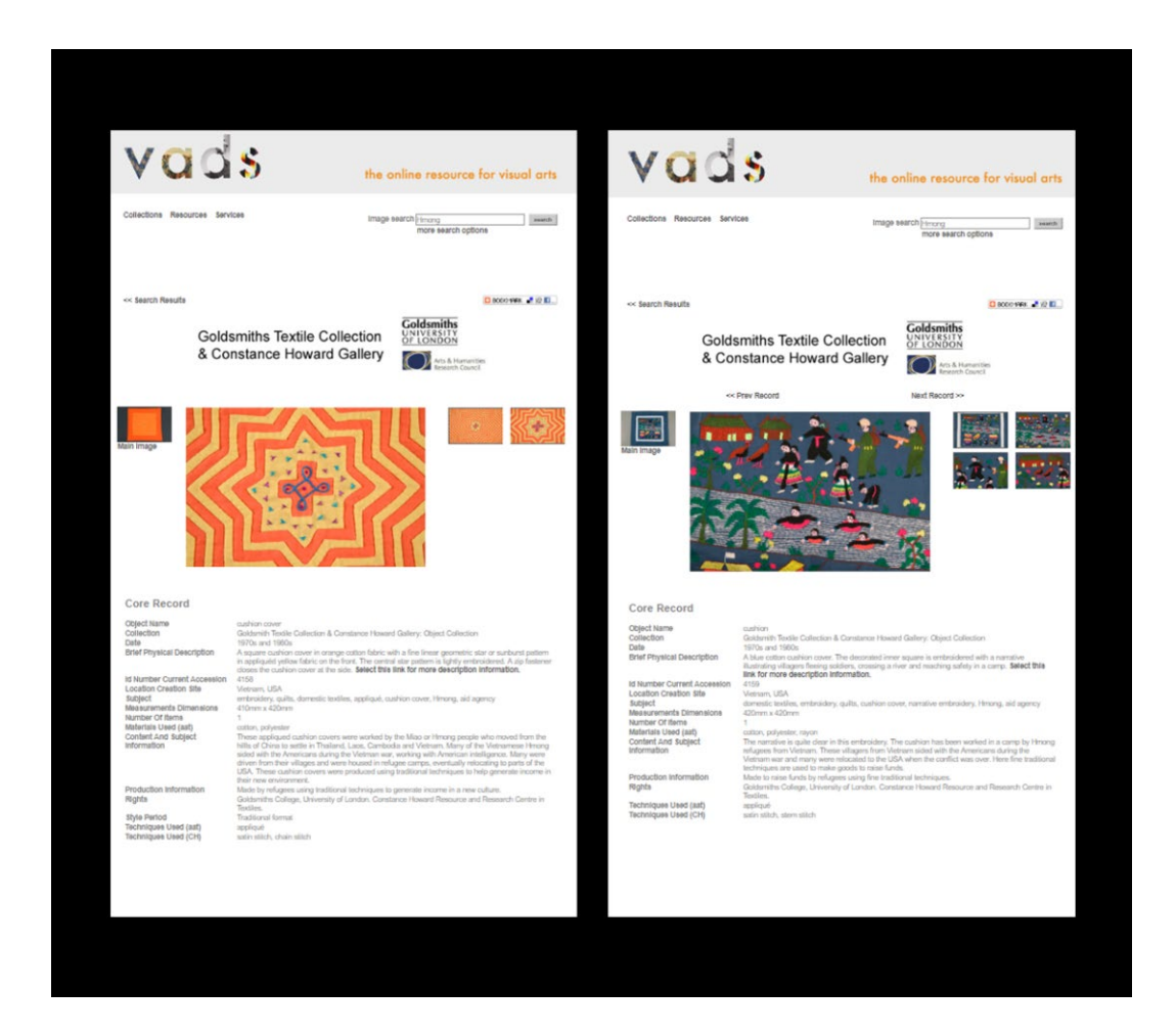
Records on VADS (Visual Arts Data Service) relating to two Hmong textiles in the GTC.