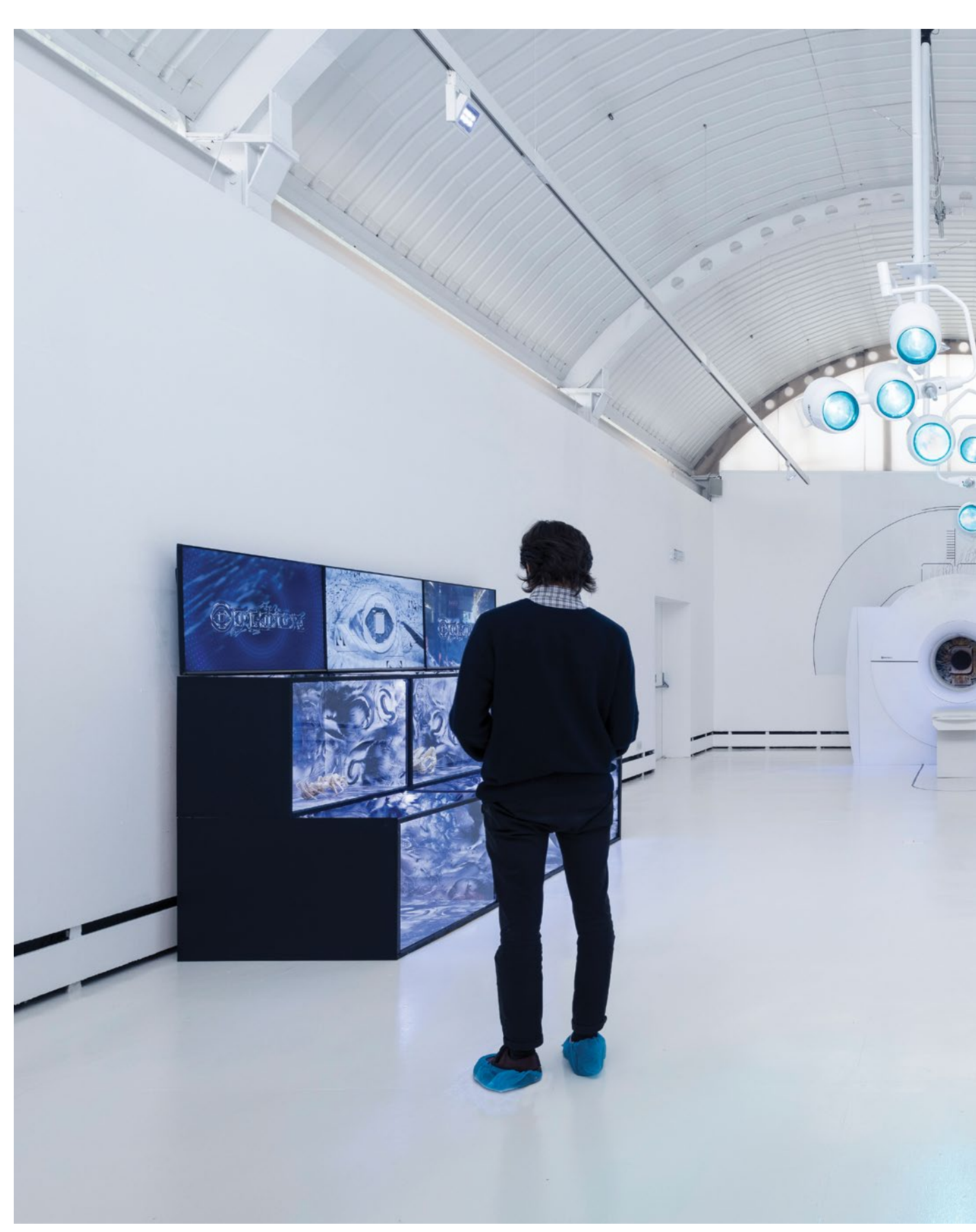
Intsallation view, Ophiux, Joey Holder, 2016