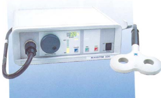
Figure 1. The magnetic stimulator

A photograph of a commercially available magnetic stimulator, consisting of a capacitor and stimulating coil ('figure of eight'). An electric current of up to 8 kA is discharged from the capacitor into the stimulating coil, producing a magnetic pulse of up to 2T. The coil is placed over a region of scalp. The application of a magnetic pulse results in a localized electric field, which transiently disrupts functioning of underlying cortical tissue.