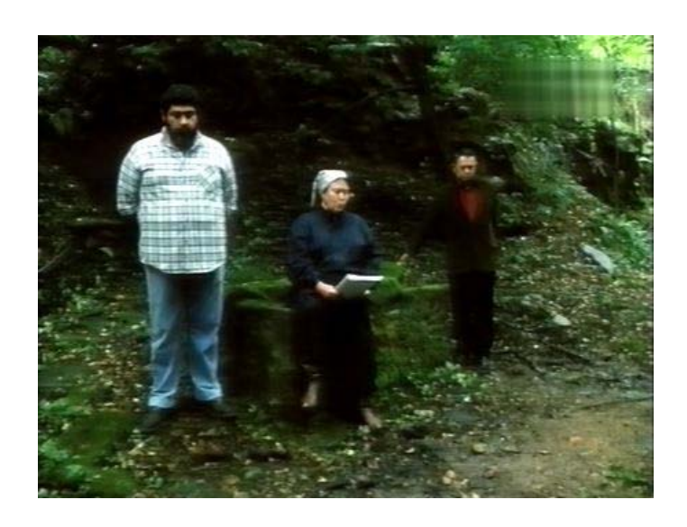
Figure 4. The group of peasants in Workers, Peasants (Straub and Huillet, 2002)

now: the oppositional framing of the bodies, the postures these bodies adopt, and the mode of speaking that issues from them.