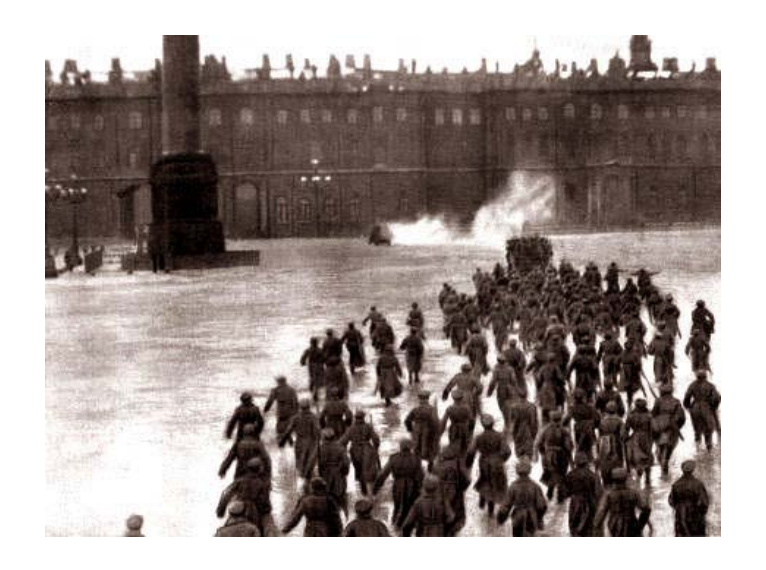
Figure 11. Anonymous photograph of the Re-enactment of the Storming of the Winter Palace (1920)

For the revolutionary Anatoly Lunacharsky, to organise a re-enactment in the extreme circumstances of the Civil War was justified because 'to acquire a sense of self the masses must outwardly manifest themselves, and this is possible only when, in Robespierre's words, they become a spectacle unto themselves'. The organisers of the re-storming thus understood that re-enactment would provide an opportunity to fuse the masses together in the form of a common aesthetic experience. Performing and witnessing the event once over was a way of provoking the participants into identification with the spirit of Revolution, a spirit increasingly under threat. And without activating the people's vital energy, the audience would remain standing before a mere spectacle of mass consumption. Against the mass entertainment of capitalism, these theatrico-politics work with 'people' as the name of an inexhaustible depository of energy, one with which the participants are to re-connect through this collective identification. In both the re-storming and La Commune (Paris 1871) the theatrical process is based on an understanding of theatre as