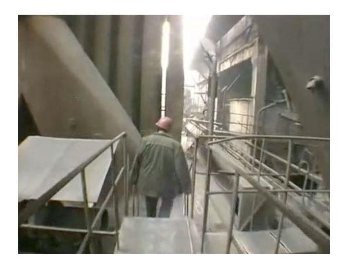
Figure 9. Still from West of the Tracks (Wang Bing, 2003)

West of the Tracks develops a hyper-observationalist form that continuously exceeds the parameters of a standard documentary function. There belongs to its images a disruptive duration of the shots that continuously oxidises a sociological purpose of observation. More generally, it oxidises the pre-determined relation between the visible and its interpretation (the intelligible). The more Wang follows the workers, the longer the takes last, and the more he endures, then the more the unfinished nature of his approach to the factory becomes apparent. This relentless oxidation does not necessarily mean that the representation of Tie Xi, the bearing witness to its decline, is impossible. Rather, it affirms a capacity of observational cinema irreducible to that of representation, a capacity to intervene in different ways in the visualisation and interpretation of the site in question in an entirely other form. West of the Tracks does not simply reveal the tragic and silent truth of the socialist factory. Through a hyper-observationalist oxidation it constructs the partial, strange, contested image of a rusting factory. The factory is not represented as an original site, a pure ruin that an observer must penetrate and decipher, but as an already