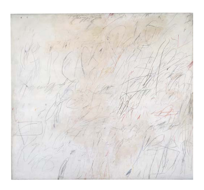
Figure 2. Cy Twombly, Arcadia (1958)

A title, as a proper name, guarantees the unity of an oeuvre. Titles have the capacity to hold together, sum up, stand for and register an oeuvre as oeuvre, countering the threat of dispersion or disorganisation. Different authors have interrogated this authority and opened up a distance between title and work that questions their presumed equivalence and unification. Adorno, for instance, pursues in various texts a crusade against the conformist titles of the culture industry. He favoured titles 'so close to the work that they respect its hiddenness', titles 'into which ideas immigrate and then disappear, having become unrecognisable'. Roland Barthes, from a different perspective, also made visible the strange distances separating title and oeuvre. Barthes explored generative distances where the proper name does not exhaust the named, or, more precisely, where the relation between titles and titled can function as a terrain to play with the expectations of nominal identification.