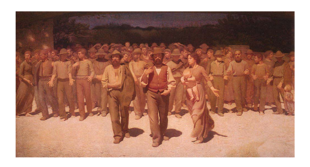
Figure 7. Giuseppe Pellizza da Volpedo, The Fourth State (1901)

Through the commentary and a series of contrasting sequences Farocki exposes this distinction between the Lumière brothers' visualisation of the workers and other images that exalt their collective power. He reads the Lumière brothers' interest in capturing the physical movement of the workers as symptomatic of cinema's 'addiction to motion'. 313 For Farocki, this addiction to movement has most often blinded cinema to collective history. The Lumière brothers' images are celebrated as a new way of looking at the world, when in fact Farocki reveals them as a new way of being blind to it. It is at the editing table that Farocki makes visible and short-circuits the consensual definition of cinema as moving image. He freezes, repeats, rewinds but also describes, discusses, narrates images