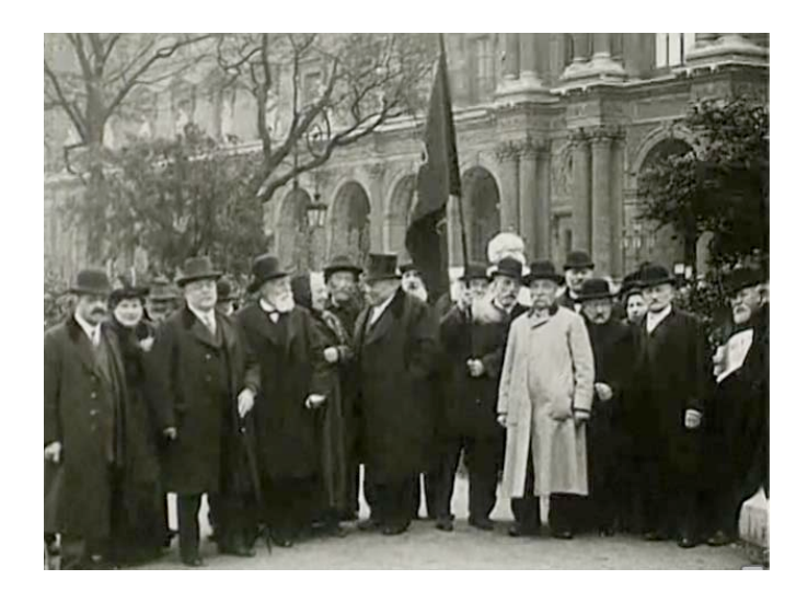
Figure 10. Still from La Commune (Armand Guerra, 1914)

knowledge the only other surviving moving image of the latter is to be found in the film Le Mur des Fédérés ( The Communards' Wall , 1935). This film, made by the cinematographic department of the French Section of the Workers' International (SFIO), documents a demonstration commemorating the Paris Commune in 1935. After a summary explanation of the events of the Commune, illustrated by photographs and drawings, the film focuses on the 1935 procession as it heads towards the Père Lachaise cemetery, where surviving communards, visible through various medium shots, are honoured. The demonstration appears as the workers' response to the defeat of the Commune. The film above all emphasises the size of the crowds on parade, a mass of hundreds of thousands of people. The voice-over proclaims: 'Workers of France. Look and awaken to your magnificent and invincible force, which is like a river current flowing to the sea'. 618