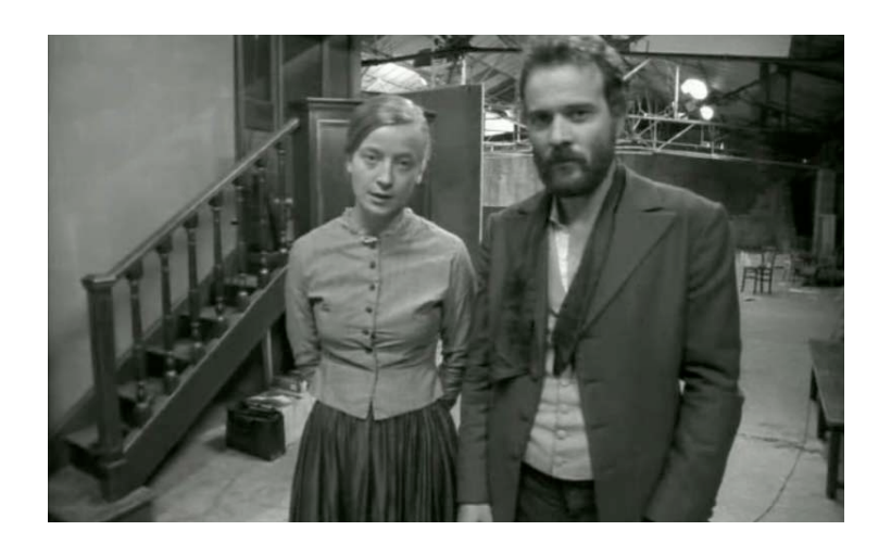
Figure 12. Still from La Commune (Paris, 1871) (Peter Watkins, 2000)

established medium of political deliberation and action. Following Agamben, one must understand this exclusion not as a pure externality, but rather as an 'inclusive exclusion'. 649 The voices of the excluded both sustain and haunt the social order and its audiovisual determinations. Animalisation, infantilisation and pathologisation are some of the modes through which the social order maintains these troubling voices outside the frame of identifiable action. 650 The militant image works with the voice of the people to amplify the resonance of its haunting powers; not simply to make voices speak, but to reorganise or re-inhabit the audiovisual field.