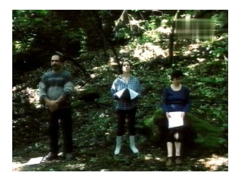
Figure 5. The group of workers in Workers, Peasants (Straub and Huillet, 2002)

Straub and Huillet do not frame workers and peasants together. They frame two clearly distinct groups. Workers occupy the frame only with workers, and peasants with peasants.