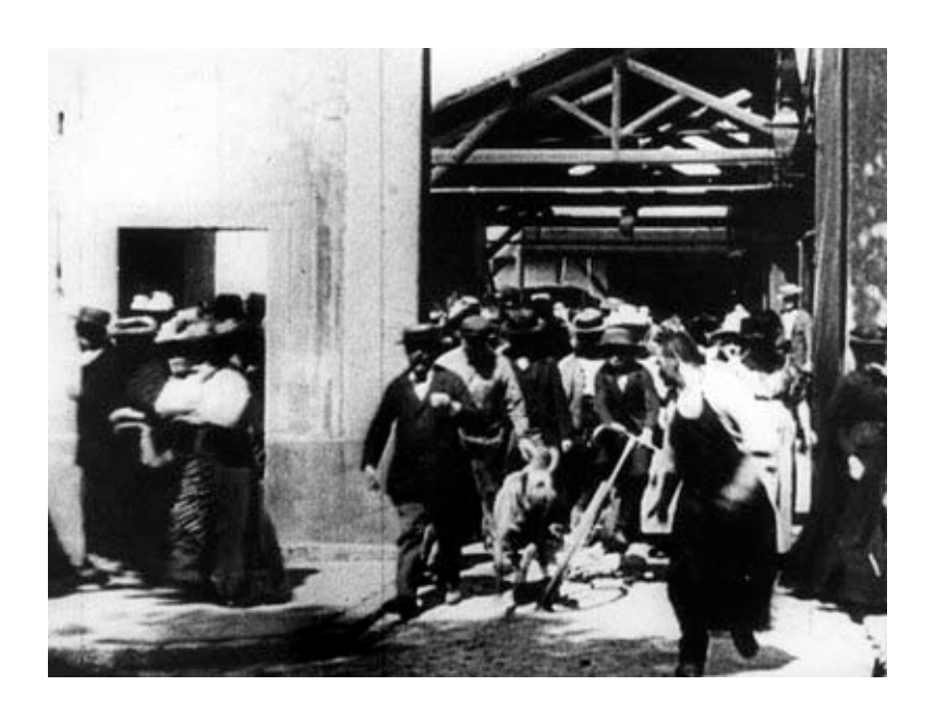
Figure 6. Still from Workers Leaving the Factory (Louis and Auguste Lumière, 1895)

images do not symbolise cinema's engagement with reality or the coming together of mass medium and mass workplace. On the contrary, Farocki learns to see these images – a lesson imparted to the spectator in turn, in their repetitive use – as an inaugural error, as evidence of cinema's culpability in making invisible the place where all politics takes place, that is, the factory. 309