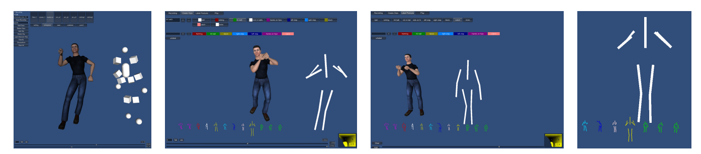
Figure 2. The evolution of the user interfaces. From left to right: the labeling interface of the first prototype the layout of the second prototype of our software which more clearly separates out different aspects of the process. Left, the screen for selecting clips; the screen for labeling feature data; the dynamic visualization of the nearest neighbor algorithm. Each data item is displayed as a stick figure. The figures are scaled in proportion to the amount of probability each contributes to the classification of the current posture.