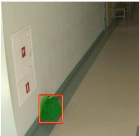
Figure 1: A suspicious item of luggage:

The “IF-THEN” rules provided the algorithmic basis for relevance detection. The development of “IF-THEN” rules, and the decision to focus on 3 areas of relevance detection, also provided an initial insight into the account-able order of the algorithmic system. In the immediate project setting, the order emerged through collaborative decision making between computer scientists from Universities 1 and 2, networking experts from TechFirm and representatives from StateTrack and SkyPort. Collaborative work also invoked a future account-able order of airport and train station interactions between the operators of the system and passengers and their luggage. The future everyday competences of the system operators involved in securing the space of the train station and airport were opened for discussion around the “IF-THEN” rules. The rules provided a basis for discussing future occasions where operators would be provided with data on which decisions would be made regarding, for example, suspicion.