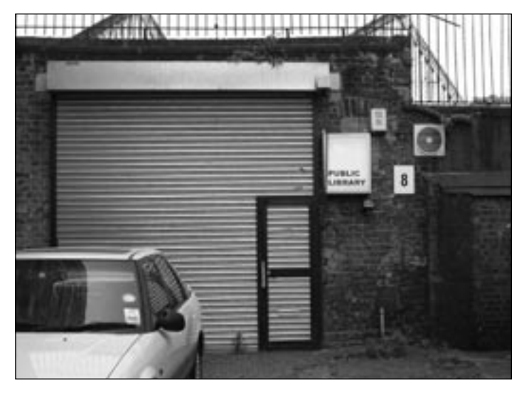
Figure 6. Cubitt Gallery, Angel Yard, 2004, with sign for "Public Library."

here from material space to considering the form of the institution as the work. The building itself was labeled with a notice—Public Library—to temporarily change the identity of the space.