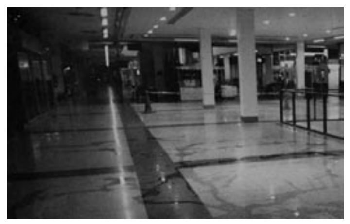
Figure 4. Bojan Sarcevic, Irrigation-Fertilisation, London: Salon 3, 2001 [ detail ].

Alternatively, the ephemera may document a work which was an installation, where the space was as represented, but it was not possible to experience it. The image in Figure 4 comes from an item produced by Salon3 to announce and document the exhibition Irrigation-Fertilisation by Bojan Sarcevic at the gallery. The artist flooded the floor of the Elephant and Castle Shopping Centre on a Sunday night. The leaflet is a single sheet of paper, folded for mailing, with an image covering one side and text in a band along the bottom that gives information about the exhibition. The leaflet is cheaply produced, one-color printing on thin paper, combining exhibition announcement and a representation of the work in one piece. The artist reflects on the site of the gallery, in this work.