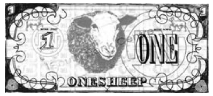
Figure 2. Factual Nonsense, One Sheep Currency Note, 1999.

A set of ephemera by Factual Nonsense (FN) was produced for a fair that took place outside the Festival Hall on London's south bank of the Thames, taking over a public space for the day. It was the second street market organized by FN; the first had been the Bull Market in Lexington Street the previous year. The program lists about fifty artists who hired stalls and sold goods or services. In the evening there was a party in the Festival Hall. The set of ephemera produced for the event references some traditional formats. The program references the format used for a parochial agricultural fair in its textual and image content; the fonts and layout are traditional and ornate. The sheep is used as the central illustration, and this image is redeveloped at the bottom where two sheep are shown, each standing with one foreleg raised, facing each other. The denomination of the fake currency note is "One Sheep" (Figure 2). This currency was bought or exchanged for pounds sterling, and the Sheep were then spent in the market. They serve both as what they conventionally are and also as souvenirs of the event.