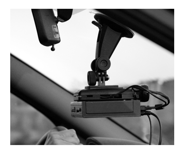
Figure 1: AutoSync for RoadMusic - PC, accelerometers and camera.

^6\mathrm{Pure} Data, is an open source programming environmement developed by Miller Puckett. [10]