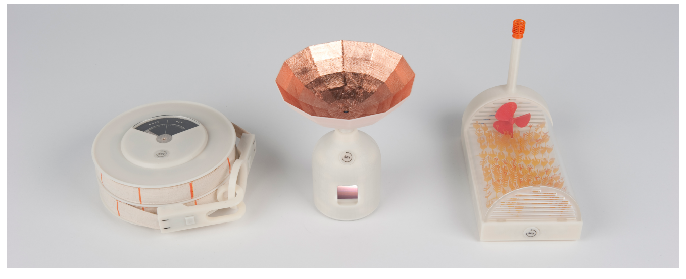
Figure 1. The Indoor Weather Stations: Temperature Tape (left), Light Collector (centre) and Wind Tunnel (right)ç

The three Weather Stations are clearly distinct devices, but they share a number of features that unite them as a family and which made their construction easier. Functionally, they all highlight potentially overlooked aspects of the home environment by displaying the outputs of sensor readings taken by the device. They also exhibit sensor legibility, in that they all make clear locally what sensors are reading, an alternative to the common ubiquitous computing tactic of treating sensors as black boxes