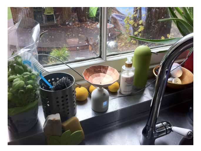
Figure 2. A Light Collector in situ.

We produced over 60 of the prototype Weatherstations, so that we could batch deploy a complete set of three to each of our 20 volunteer households. One of the reasons that trials of multiple copies of highly finished prototype devices are rare is that they are difficult to achieve. Apart from SenseCam [23] most of the studies we have reviewed use off-the-shelf hardware with occasional augmentation, whereas our approach involves producing highly finished bespoke computational devices. Batch producing and deploying such devices raised many challenges. In order to achieve the research reported here we built workshop facilities including a Dimension Elite object printer, a lasercutter, and reflow soldering oven, as well as a team with