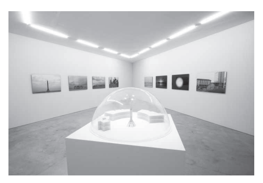
Kiluanji Kia Henda. Icarus 13, 2008. Photograph mounted on acrylic frame, 3 \times 120 \times 8 cm., maguette and text.

Kia Henda's installation Icarus 13—The First Journey to the Sun (2008) is also rooted in the revolutionary politics of Neto's generation. The work combines photographs, text, and an architectural model to tell the science fiction story of an African space mission to the sun that sets off from Luanda. The hilarious proposal to travel to the sun "at night" and to stay for "a period during which the sun cools down for 8 hours" is based on an anecdote about the first president of Mozambique, Samora Machel.<sup>30</sup> During a visit to Angola in the early years of independence, Machel apparently boasted that his country would outdo the American moon landing by making a journey to the sun. Asked how they would achieve such an impossible feat without following Icarus's fate and being burnt by the sun's heat, he replied: "I have the solution! We will go at night!"<sup>31</sup>