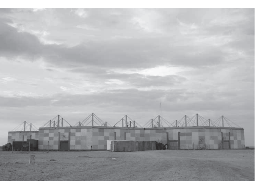
Kiluanji Kia Henda. Centre of Astronomy Studies and Astronauts' Training . 2008. Photograph mounted on acrylic frame, 8 \times 120 \times 80 cm. Namibe Desert.