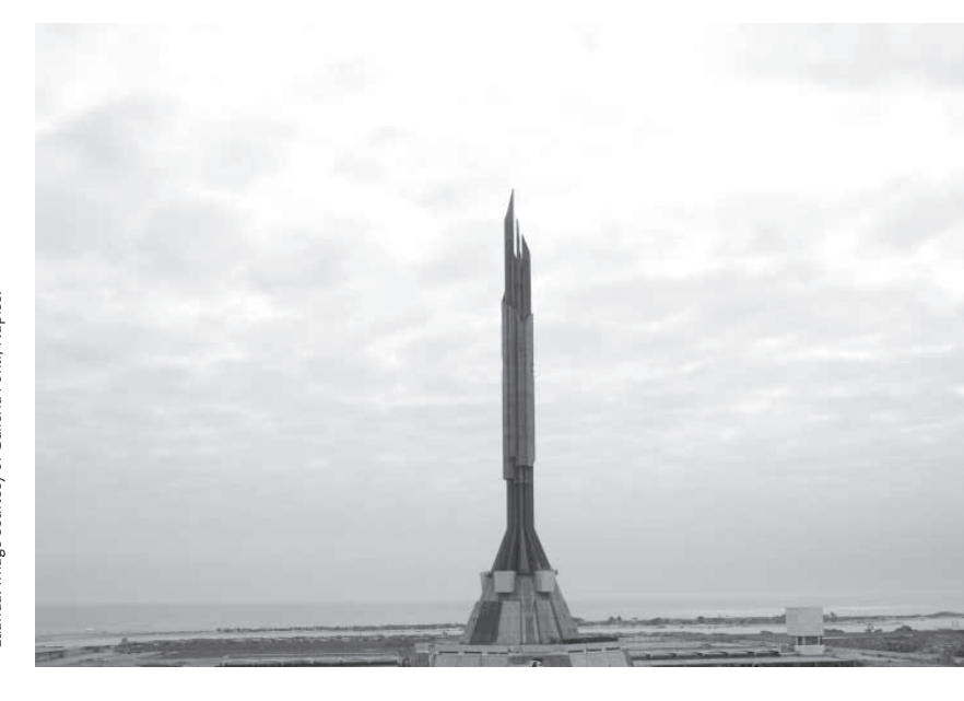
kiluanji Kia Henda. The Spaceship Icarus 13, 2008. Photograph mounted on acrylic frame, 8 × 120 × 80 cm. uanda.

ing them to abandon their homes and leading to the devastation of urban infrastructures. In the midst of this destruction, monuments were erected to a different utopia, testifying to Angola's brief period of Marxist-Leninism and the country's uneven "socialist friendship" with the Soviet Union.<sup>38</sup>