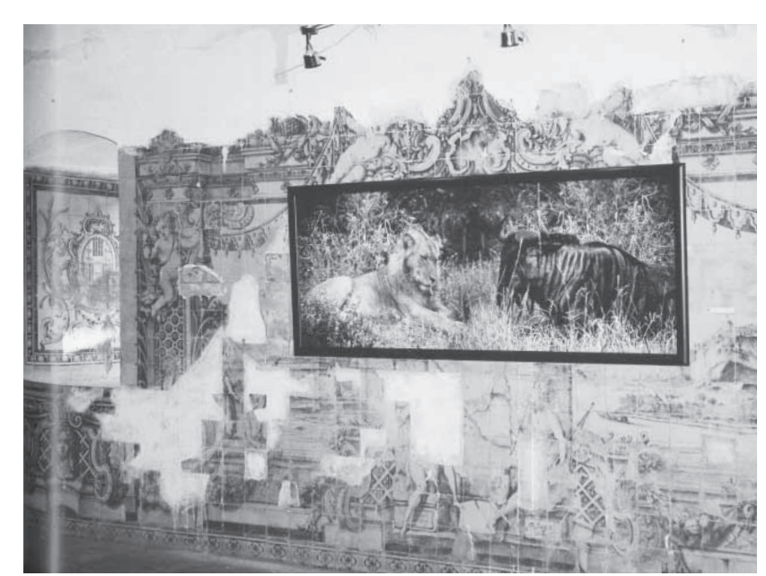
Art Orienté objet. Líon & Ox, 2006. Photograph, 75 × 200 cm.

and Mozambique.<sup>24</sup> Instead of depicting a paradise, AOo's composite images reflect the reality of animal containment and displacement, in which different species that would naturally stay away from each other and migrate vast distances are forced into close proximity because of unnatural overcrowding in the reserves. In The Escape , a pathway is hemmed in on both sides by walls of metal and wire; these fences are used to keep the animals in, and to protect them from poachers, but they also prevent the long migrations that animals of the savannah depend on. Humans are implicated in these images, too, as the fences cannot help but recall other borders or camps, marking this uncertain postconflict moment when national borders were becoming more rigorously policed.