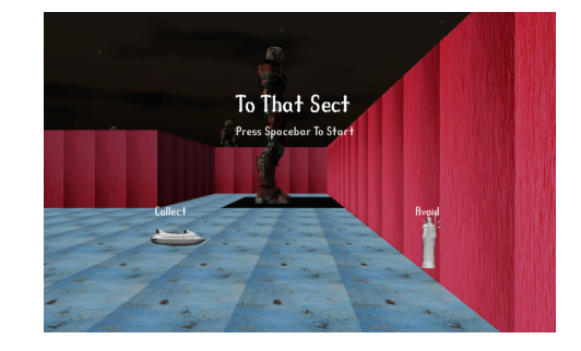
This is a game about a disgruntled child. A founder. The game only has one level, and the objective is to reach the exit. Along the way, you must avoid the Tomb as they kill you, and collect the Ship. I use some sound effects from FreeSound, like the sound of Ship. Using Google and a tool called Metaphor Magnet, I discovered that people feel charmed by Founder sometimes. So I chose a unnerving piece of music to complement the game's mood.

As with the prior section, ANGELINA<sub>4</sub> has a predesign phase in which it gathers media for use in the CCE phase. We describe this process in more detail in [27]. Using frequency analysis on a corpus of English text, ANGELINA<sub>4</sub> extracts a word from the input phrase that is rare, but has a minimum number of mentions in the corpus. It then proceeds