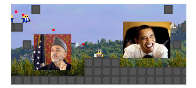
Fig. 4. Screenshot from Hot NATO , a newsgame about the war in Afghanistan. Playable online at www.gamesbyangelina.org/games