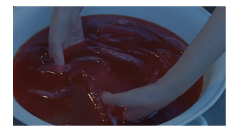
Screenshot 21: Kayoko is dying a white fabric red.