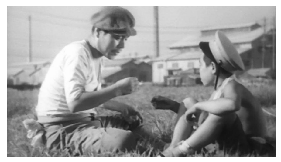
Screenshot 3: Yasujiro Ozu's An Inn in Tokyo, 1935