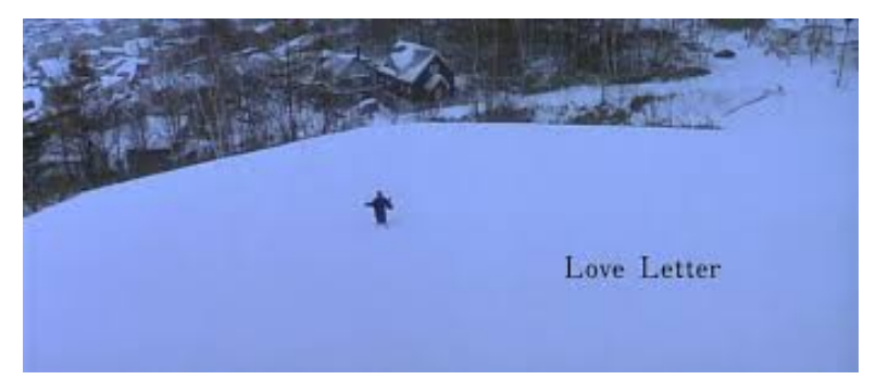
Screenshot 18: Love Letter's opening scenes

Similarly to Maboroshi , nature plays a leading role in Love letter . And despite the fact Love Letter 's narrative continues throughout one season (winter) and only comes to spring in the very last minutes of the film, this cyclical presentation (more consistent in Maboroshi ) emphasises the changing emotional states of the protagonists. Snow, light and shadows are strategically employed to support the story and the feelings they intend to invoke. In Love Letter , the film begins with wide shots of snow-covered hills in dark and cold blue light. As the narrative slowly progresses it moves on to brighter winter shots symbolising the development of the story and minor changes within the characters. It then concludes with the first signs of spring.