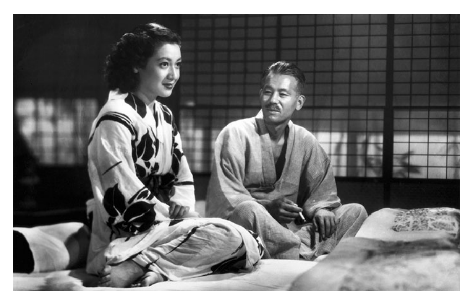
Screenshot 4: Yasujiro Ozu's Late Spring, 1949