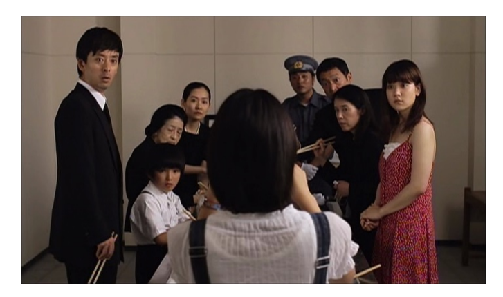
Screenshot 44 : The youngest daughter is taking a photo of her father's ashes surrounded by the rest of the family members.

their mother. The comical and openhearted manner in which the director portrays the girls' journey is a definite transformation. The atmosphere at the father's is dramatically lightened as the youngest sister follows through on her mother's request and takes a photo of her dad but in a state of ashes after the cremation. This is followed up with her also taking a small piece of his bone left in the ashes as a way of reconnecting her family with the father who left them years ago.