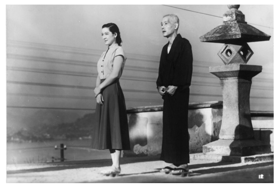
Screenshot 5: Yasujiro Ozu's Tokyo Story, 1954

By looking at the information stated above one could easily see the individualism and innovation of Ozu's cinema. Ironically, however, it is a fact largely overlooked, that Ozu's cinematic endeavours were initially fully inspired by the American cinema of 1910s and 1920s as well as its techniques. It is evident that Ozu was very much influenced by the international film industry: "he saw countless American silent comedies in Japan and regularly watched American films while overseas in Singapore that had been confiscated by the resident Japanese military." (Marran, 2002, p.166)