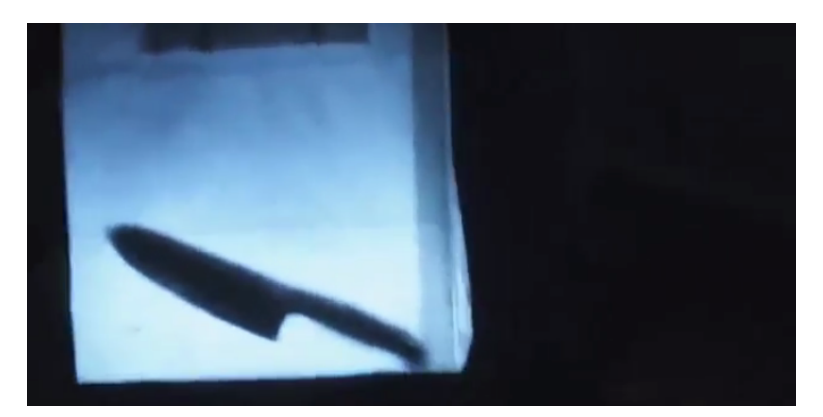
Screenshot 37: The knife he begins to carry in the paper bag.

Keiko continues to visit Sumida's boathouse and they continue to get into violent arguments. At one point Sono presents a scene of another rainy day, however, the sun's beams are also present. Faint rays of hope become apparent. Keiko carries a big transparent umbrella and wears a red dress that contrasts beautifully with her black hair.