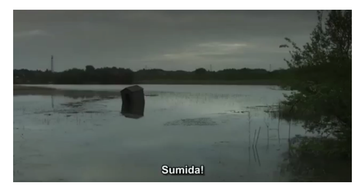
Screenshot 29: The scene of the river.

of things lost. The "normality" that house represents is now floating adrift. While watching the river Shozo's face shows pain and fright, then a dream-like (or rather nightmare) sequence of destruction fields appears again. The hard cuts between the reality and the memories of destruction create a sharp effect on the viewer, which feels like watching a nightmare and waking up to a reality that is not far from a nightmare as well.