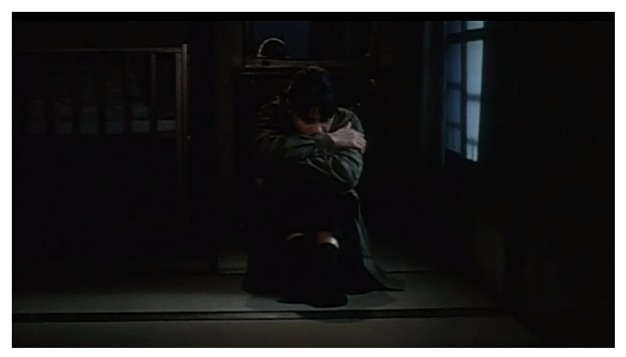
Screenshot 12: Yumiko after Ikuo's death.

Five years pass and Yumiko agrees to an arranged marriage with a widower Tamio (Akira Emoto) who lives with his daughter in a small, isolated fishermen's village in the Noto