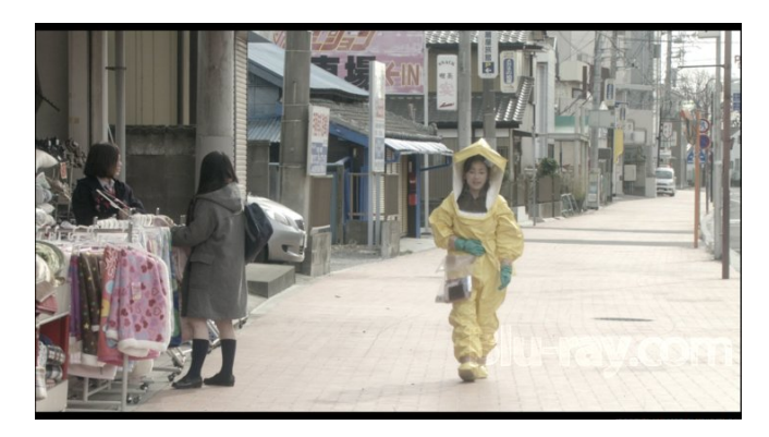
Screenshot 43: Izumi is wearing a contamination suit while walking outside.

A similar theme is conveyed in Sion Sono's The Land of Hope (2012) in which one of the protagonists Izumi also comes to obsess about the threats of radiation and its effects on her unborn child causing a local disturbance and her eventual rejection from the surrounding community.