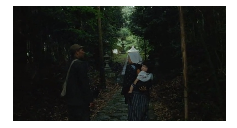
Screenshot 24: A flashback scene of Takumi's father leaving for war.