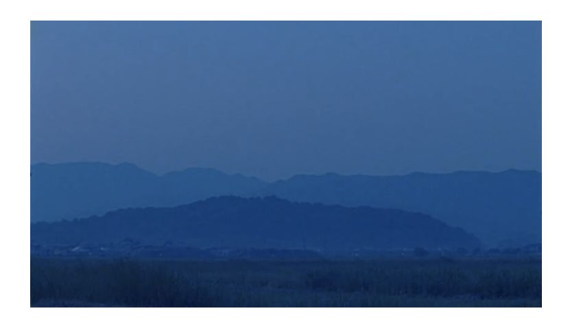
Screenshot 20: Hanezu's opening scene of the three mountains.

The opening mountain scene continues with a shot of the rising sun; a female voice-over begins to read a passage from another poem from Manyoshu , written by Empress Jito<sup>43</sup>, translated in the film with English subtitles as follows: