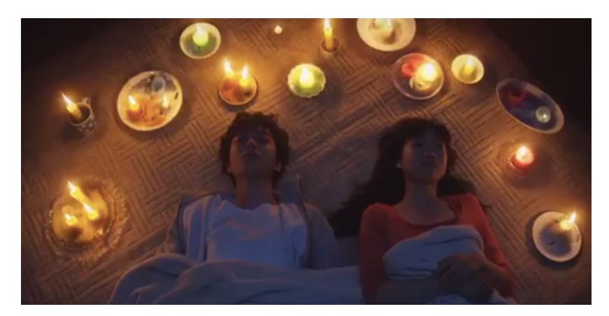
Screenshot 42: Keiko and Sumida on the floor surrounded by candles.

Keiko stays behind and tells Sumida that he can't kill himself because if he does she won't be able to go on living either. They lay on the floor surrounded by candles as Keiko paints a picture of their future together as a family. Even though Sumida cries struggling to believe it, she encourages him to imagine it knowing that this image will help him carry on living.