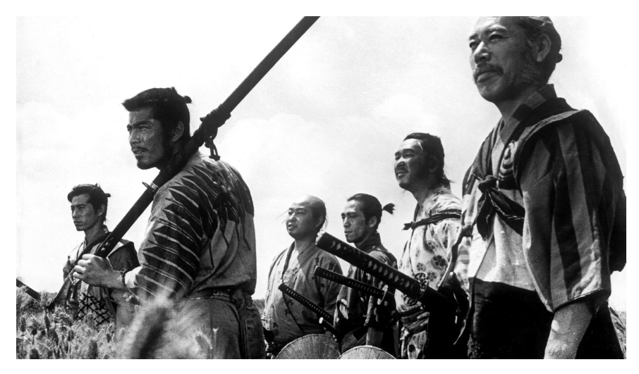
Screenshot 2: Akira Kurosawa's Seven Samurai, 1954