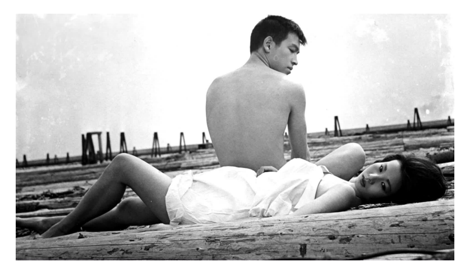
Screenshot 8: Nagisa Oshima's Cruel Story of Youth, 1960

Consequently, in post-occupational Japan of the 1960s and the 1970s the Western ideas of love and sexuality fully began to 'flourish' (even though desire and liberation of old family values was also still negotiated and revolted against in the West). Newfound liberties in love and sex were used as weapons against political forces. In cinema, love suicide (as a form of social revolt) has become a primary Japanese love narrative, therefore, in a sense, also becoming the representation of protest against the society where romantic values were muted.