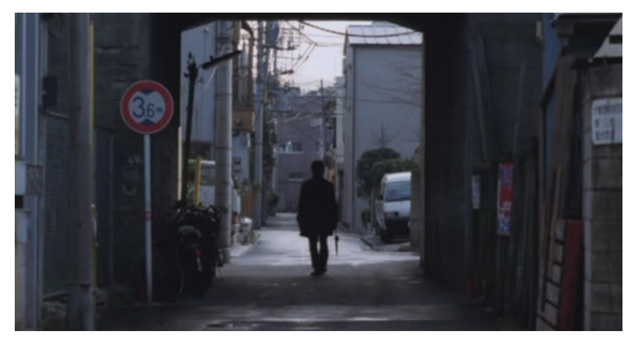
Screenshot 10: Yumiko watches Ikuo walking to work for the last time before his death.