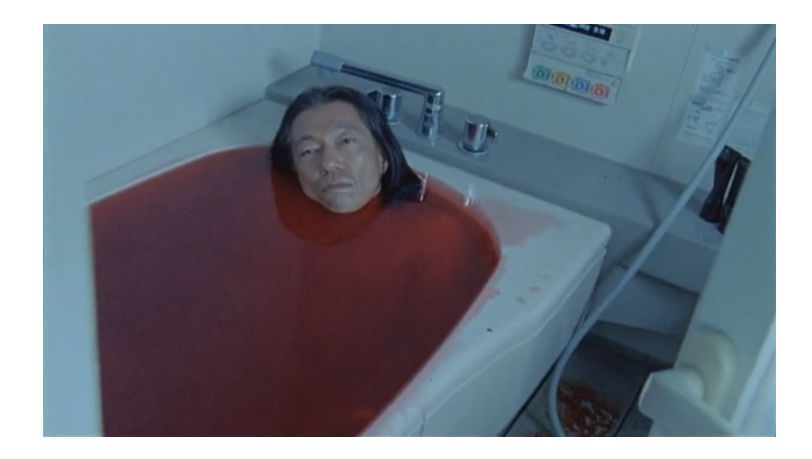
Screenshot 25: Tetsuya's suicide.

A sign reads: "With time my heart takes in all the shades of red". This subtly creates a connection with all the metaphors occurring in the visual narrative of the film. Some of them are more obscure; some of them are more obvious in a sense that they represent death and suffering such as Tetsuya's suicide. He is shown lying in a bath tab completely covered in water stained with crimson red blood.