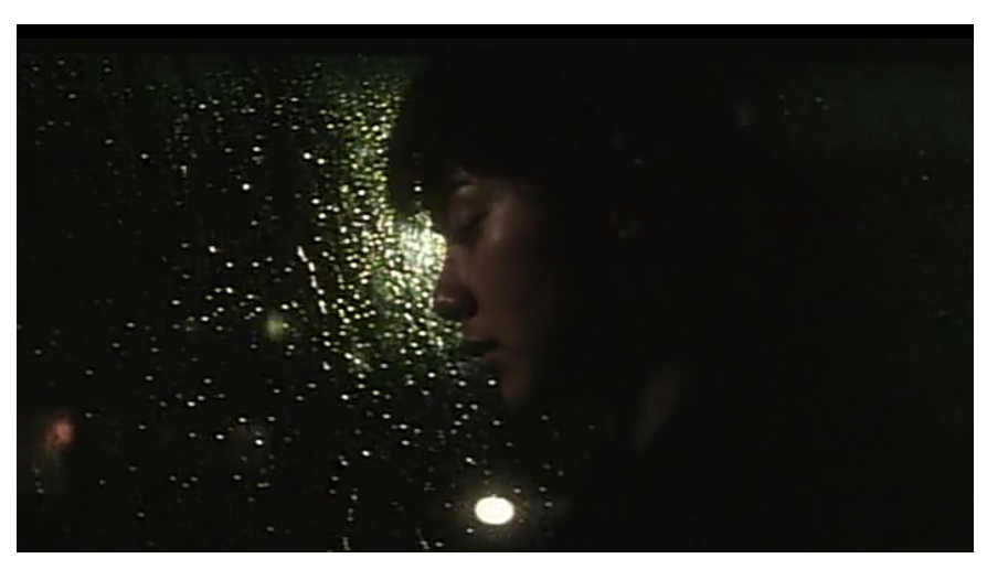
Screenshot 11: Yumiko after she found out about Ikuo's death.