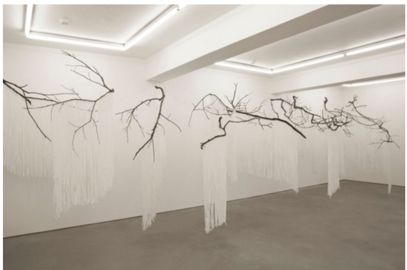
Seung-taek Lee MOTINTERNATIONAL London installation view