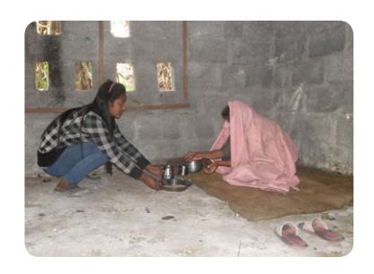
A women has to sit, eat and sleep separately during menstruation

The research confirmed that there is an assumption that once a woman is married she will not need contraception. Young married women who were informed told peer educators that they would like to access family planning to space their children and address sexual and reproductive health problems that they face. There was also evidence suggesting that women did not have enough rest during pregnancy or after giving birth because of their heavy workloads. Unsafe abortion is being practised when women cannot cope with having yet more children. Peer educators concluded that married women need education about family planning and safe abortion, as well as a safe and confidential space to discuss problems that they are having with their health, sexuality and relationships.