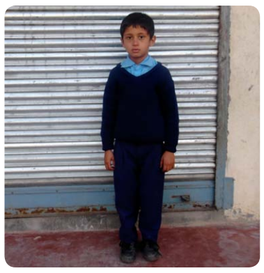
The different roles expected of girls and boys: The boy ready for school, the girl ready for work