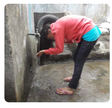
Adolescent girl washing only her hair during menstruation