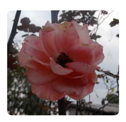
Rose depicting marginalised third gender youth being able to open up and talk about their sexuality