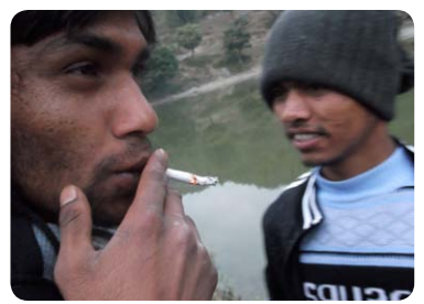
Young man smoking a cigarette and discussing the serious problems of drug abuse in tourist areas

Peer groups that have been set up in different village development committees are regarded as successful due to the intial training for peer educators, their performance review meetings supported at branch level and the encouragment of monthy peer meetings so that young people can share their problems.