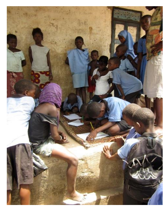
Children and adults facilitating children in Sierra Leone

"The outcomes of initial community training with children, adults, teachers and staff, carried out for Street Child of Sierra Leone, are demonstrated by the increased activity of 'kids clubs' which have been set up in 17 schools, involving over 1000 children. Children in these clubs have set their priorities for involvement in decision-making in the school and home environment, including more autonomy to elect school prefects, more consultation over next-level school choices and the space to plan and carry out their own child rights advocacy. As part of a wider programme that involves reunification and the reinsertion in school of streetconnected children. 'Kids clubs' members have reduced stigma and discrimination against children who have lived in the street or teenage mothers who have come back to school by organising debates and discussions on the topics and counseling peers. Children in these clubs have been pivotal in championing not only child rights, but also children's responsibilities that go with rights, responding to tensions between traditional leaders and children, who complain of a loss of respect for elders. The challenges that the local organisation now faces are adapting ways of working, and securing resources to ensure that children participate in planning, implementing and monitoring activities that affect them."