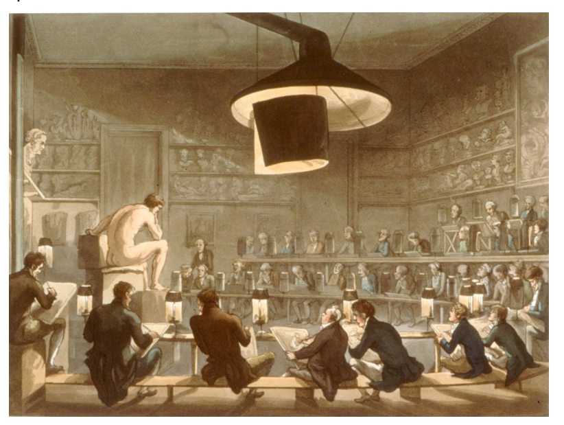
Figure 8. Thomas Rowlandson and Pugin, A life class at the RA, 1811

The female model presented high-minded artists at the Royal Academy with several problems. First, there was no established precedent for the use of the female model in European academies, there was no theoretical basis for instruction. Secondly, unlike male classical statuary which had been perennially classified and quantified, female physical perfection, as embodied in statues such as the Venus de Medici was far more subjectively considered. Finally the low status of female models was gravely at odds with the aura which surrounded their mythological counterparts. Male models, chosen principally for their musculature and physique, were often pugilists or soldiers. As such they were respected as individuals whose athletic appearance echoed the classical heroes with whom they were compared. Female models by way of contrast, were regarded with curiosity and suspicion, especially as many were also prostitutes.<sup>38</sup>