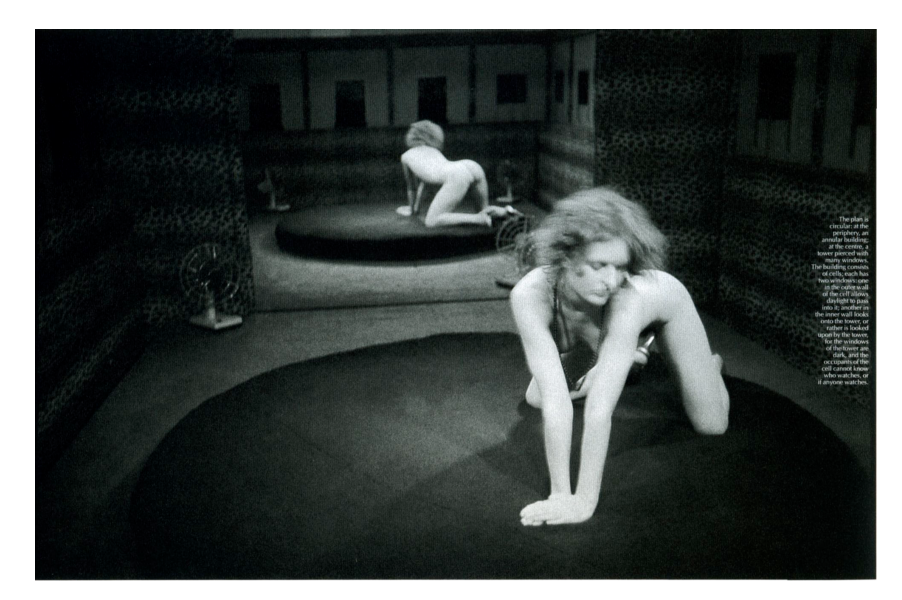
Figure 5. Victor Burgin Panopticism from Zoo 1987