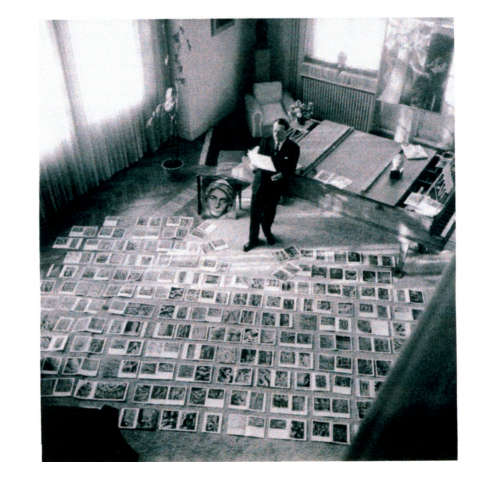
Figure 13. André Malraux with images from Museum without walls c.1950

etc), and the effect of compiling a series, or montage of images, where ideas and associations may arise because of what the image is placed next to. In a Barthesian sense this intertextuality brings with it a contemporary approach to interpretation. Within this secondary level of the effects of montage and the unpredictable effects of compiling copies, there is yet a further similarity and divergence with the art academy and the history of vision. For as long as the art academy has been in existence, there was an importance put on gathering a collection of drawings or prints from which to learn, to draw and to reference the canon. If copying in the academy guards against the modernity of photographic reproduction, then the montage of images, reproductions working within the space of research, becomes the place for speculative interpretation.