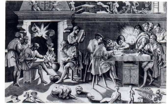
Figure 3. Baccio Bandinelli's Academy in Florence, c. 1550 engraved by Enea Vico