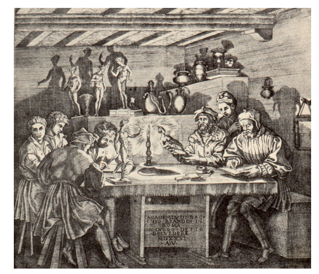
Figure 2. Baccio Bandinelli's Academy in Rome, engraved by Agostino Veneziano 1531

at all. They could be writing or drawing. An elder, dressed in classical robes sitting to the left seems to be speaking and the others writing or listening.