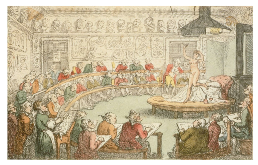
Figure 6. Thomas Rowlandson Drawing from Life at the Royal Academy (RA)