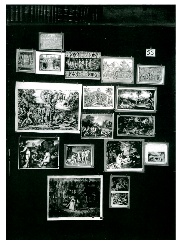
Figure 14. Aby Warburg plate 55 (Warburg, Der Bilderatlas Mnemosyne)

Warburg was fascinated by Manet's invention of the modern picture that breaks with academic conventions and decorum while integrating an ancient motif of river gods from an engraving by Raimondi of 'The Judgement of Paris'.<sup>63</sup> Exactly this kind of drawing from Raimondi would have been common at the art academies for students to copy. Pin board 55 collects an investigation into that motif, from Raphael to an ancient Roman sarcophagos.