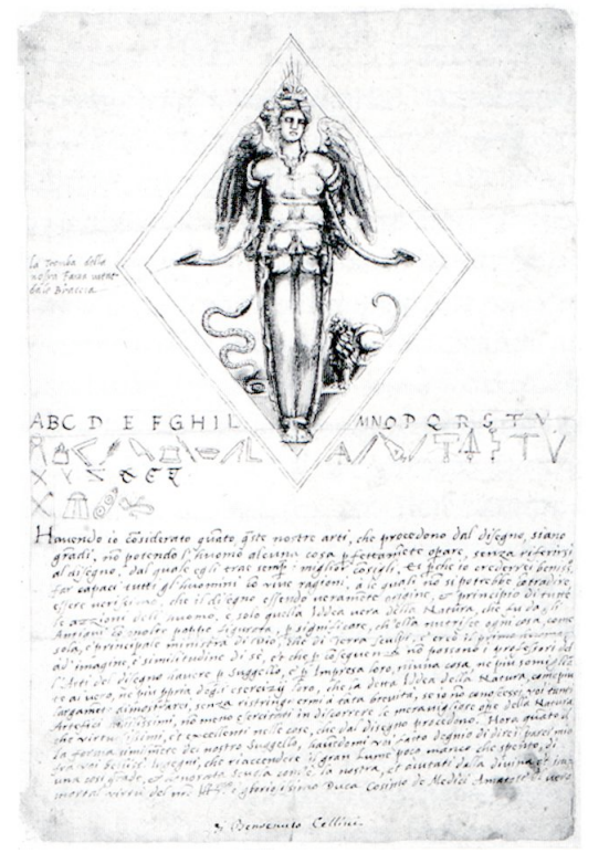
Figure 4. Benvenuto Cellini, design for seal of Florentine Academy

proposed the learning of geometry and anatomy, but this never really got under way and by 1575 there had been letters of complaint, and anxieties expressed that the educational nature of the instruction had been forgotten.<sup>17</sup>