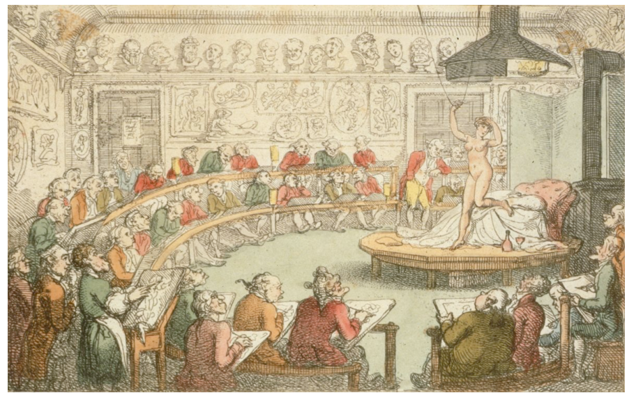
Figure 6. Thomas Rowlandson Drawing from Life at the Royal Academy (RA

heterosexual desire, visual pleasure and exhibitionism.<sup>37</sup> If we look again at the Thomas Rowlandson (1756 –1827) water colour of the life room, we can see a parody of the academy. While it looks fairly straight forward from a modern perspective, if a little jovial, its eighteenth century context of comedy is resting on its out-of-order parts, its sending-up and inverting of the constituent elements and conventions, not describing them as they were.