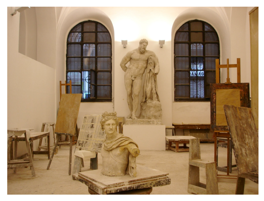
Figure 12. Sculpture studio, Accademia di belle Arti, Napoli. (2004)

It is not quite right to say the life model stands in for the cast, in the same way as the cast stands for the original marble, though it would be perfectly possible to arrange a class without the live model, and in fact the younger students and women were confined to work only from casts. The fact that the model is living is important, the class had to entomb him, those drawing had to see past him, literally into the distant past. Life drawing in the academy is a deadly practice, the life room is the still life room, with its