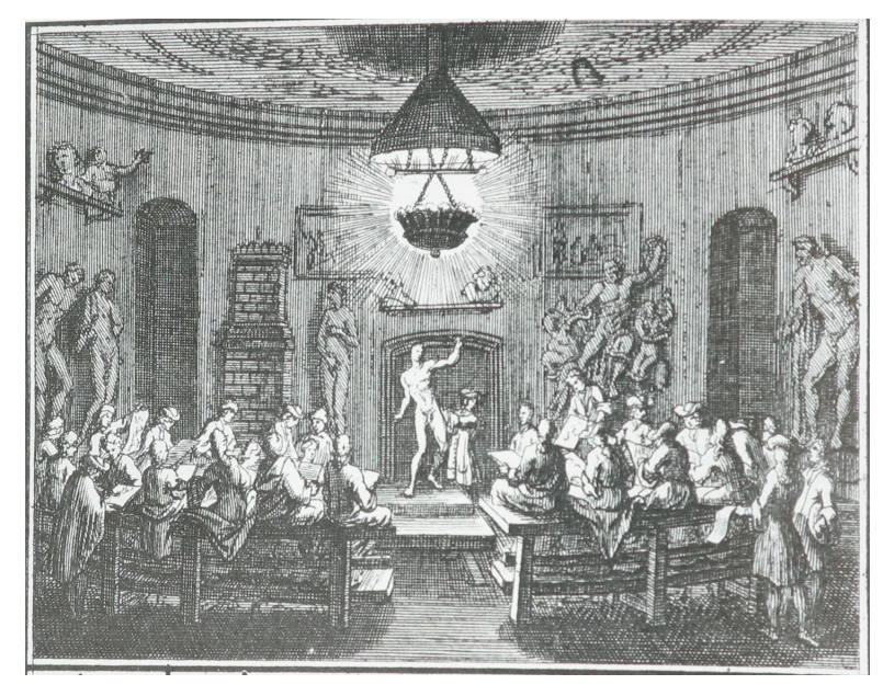
Figure 11. Engraving after pen and ink drawing by Augustin Terwesten, (Specht)

There is a strange elision in representations of the academy drawing classes. If you consider the images here by Charles-Nicolas Cochin the Younger (1715-1970) (fig 9), and Charles-Joseph Natoire (1700-1777) (fig10), both based on the Paris Academy, and Augustin Terwesten (1649-1771) (fig 11), from the Berlin Academy the style of drawing is uniformly applied across the quick and the dead. They all three show students life drawing amongst the cast collection, or near to whole casts and statues, though the difference between the statues and the live nude models is difficult to detect.