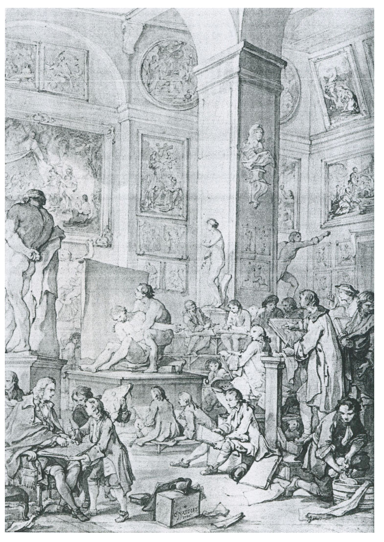
Figure 10. Charles Joseph Natoire, The Life Class at the Academy 1746