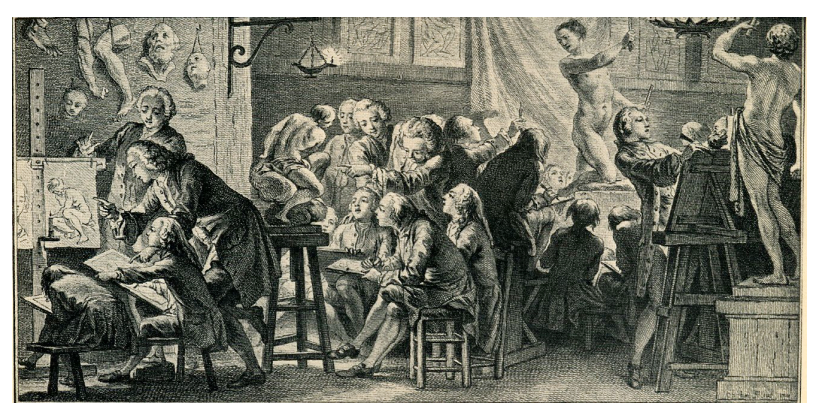
Figure 9. Charles Nicholas Cochin the Younger, The programme of French art Instruction in the eighteenth century , 1763 (Pevsner)

"...even as the artist positioned himself in front of the living model, the body had a priori been envisioned as an antique sculpture or an engraving from a Renaissance master. The referent thus remained the world of art, which mediated between the artist and the world of real bodies."<sup>40</sup>