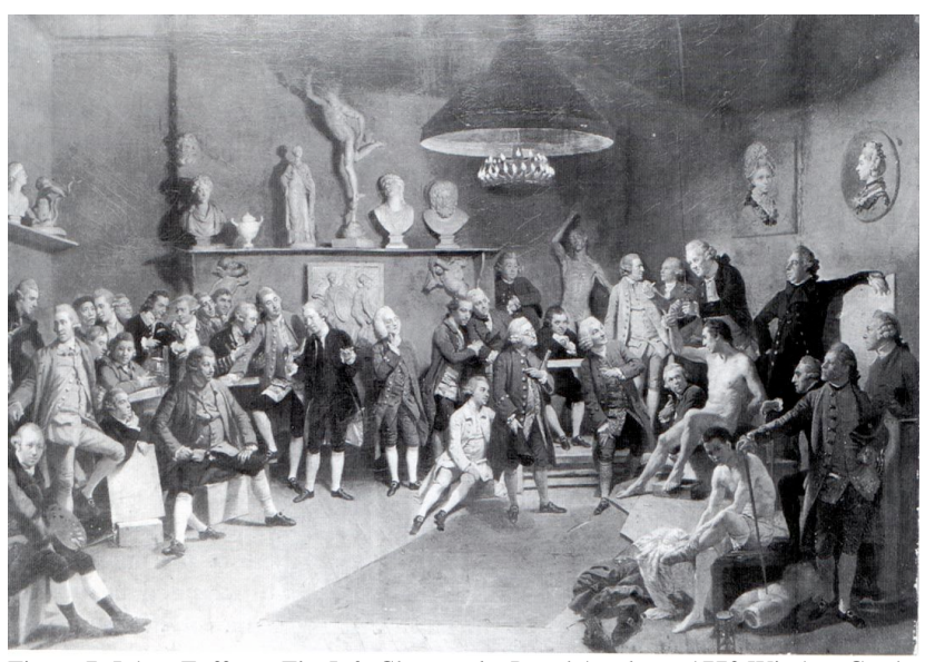
Figure 7. Johan Zoffany, The Life Class at the Royal Academy. 1772 Windsor Castle

While the male model was the standard pedagogic imperative, women were not admitted to study from the live model. This is interesting both for the history of women artists, and for the history of the male nude.<sup>35</sup> One well known description/depiction of the condition of exclusion for women artists is the Life Class at the Royal Academy , London by Johan Zoffany, (1772) which becomes the focus of consideration in the second chapter. This painting can be seen as an unintended document for early feminist art history. Here we see the odd predicament of being female and being an artist at that time – the two women members of the Academy, (not students, but Academicians, the first and last until the twentieth century), are represented as cameo portraits on the wall as it was not suitable for them to be in the presence of the nude male models in the life room.<sup>36</sup>