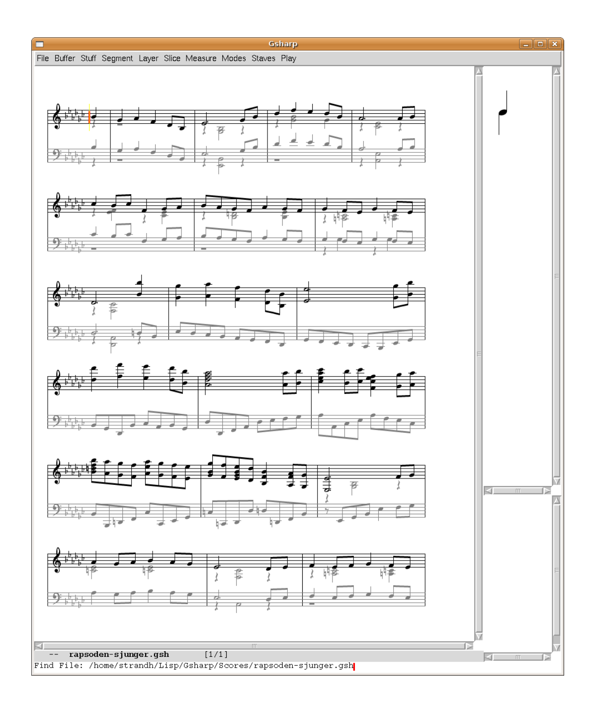
Figure 3: The Gsharp score editor. When the buffer is in melody mode, individual keystrokes move the cursor and insert or remove notes, accidentals, key signatures, and other elements of musical notation. When the buffer is in lyrics mode, the cursor movement keys remain the same but the movement commands act on lyrics rather than notes, as do the editing and insertion commands. This difference in behaviour is mediated using methods on find-applicable-command-table.