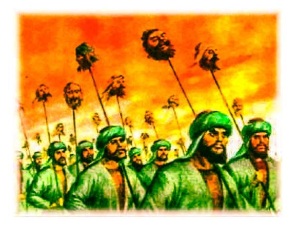
Figure I: The 'barbaric' Muslim 'other' as depicted in imagery of the Hindu right-wing<sup>xxi</sup>

artwork and images that aesthetically delimit Hindu nationalism and it is a violent demarcation of the quotidian type as these images are reproduced on items such as household goods. They not just indicate a fear of what is termed everyday as noted above, but the images themselves are everyday in their aesthetic ubiquity.