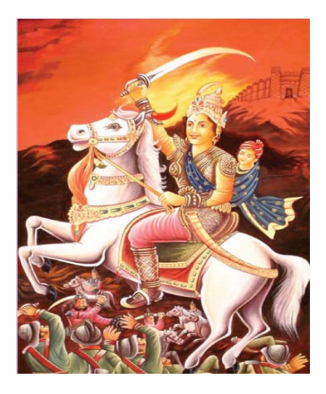
Figure VII: Rani Laxmibai of Jhansi<sup>xlvi</sup>

Rani Laxmibai (the Queen of Jhansi)<sup>xliv</sup>, depicted as perched on a horse with a sword in her hand and her baby strapped on her back ( Figure VII ) represents enlightened motherhood. Devi Holkar<sup>xlv</sup> , portrayed in paintings as widow clad in white, leading the kingdom with purity and religion while training herself in the use of weapons, represents ideal leadership and dutiful efficiency as she remains "an ideal daughter, daughter-in-law, mother, as well as stateswoman." (Figure VIII)