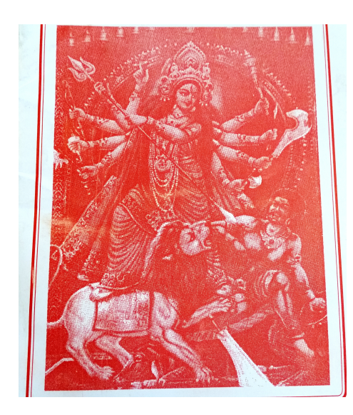
Figure III: The 'warrior goddess' Durga<sup>xxxiii</sup>