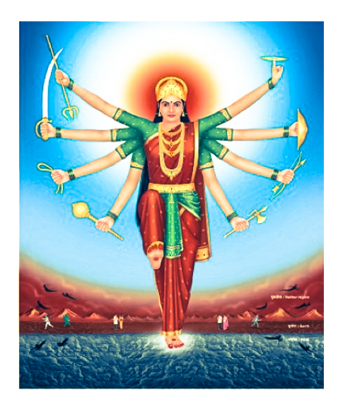
Figure V: Ashthabhuja, the eight-armed goddess<sup>xxxviii</sup>

education) allows Hindu right-wing women to bridge the divide between the personal and the political and the spectacular and the everyday.