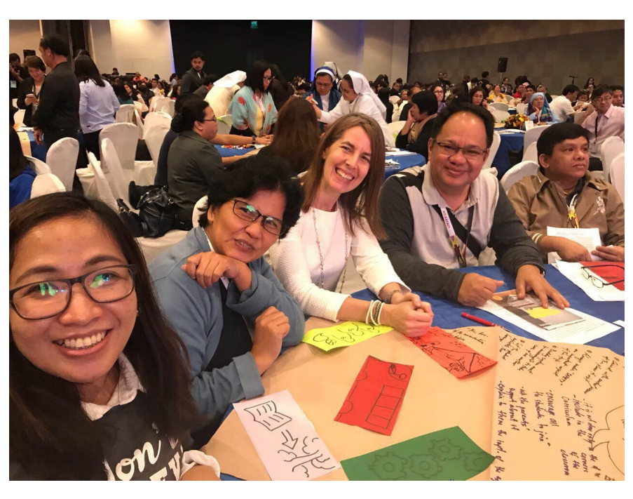
Practice-oriented Research in Designing Education: Perspectives, Prospects, and Possibilities