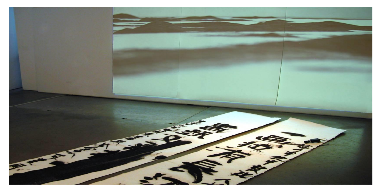
Image: Kim Jongku, Mobile Landscape , 2009, steel powder, CC camera, LED projector, paper roll, dimensions variable

Monday 24 September 2018 12.00-1pm F201 All LASALLE staff, students and alumni are welcome