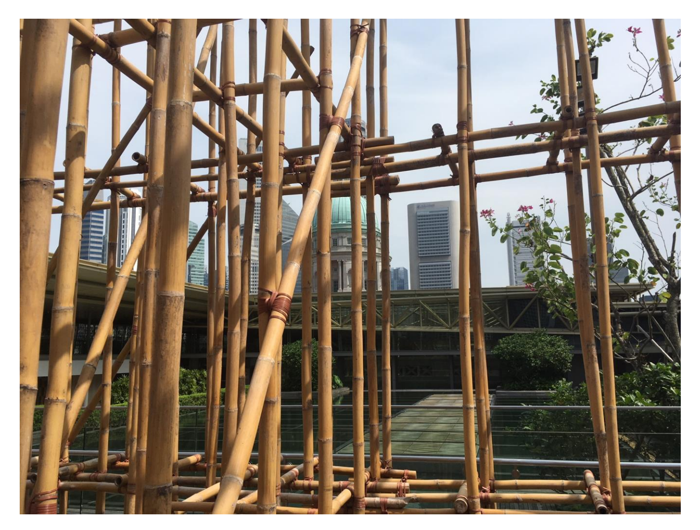
Image: Rirkrit Tiravanija, untitled 2018 (the infinite dimensions of smallness) , Ng Teng Fong Roof Garden Commission, National Gallery Singapore