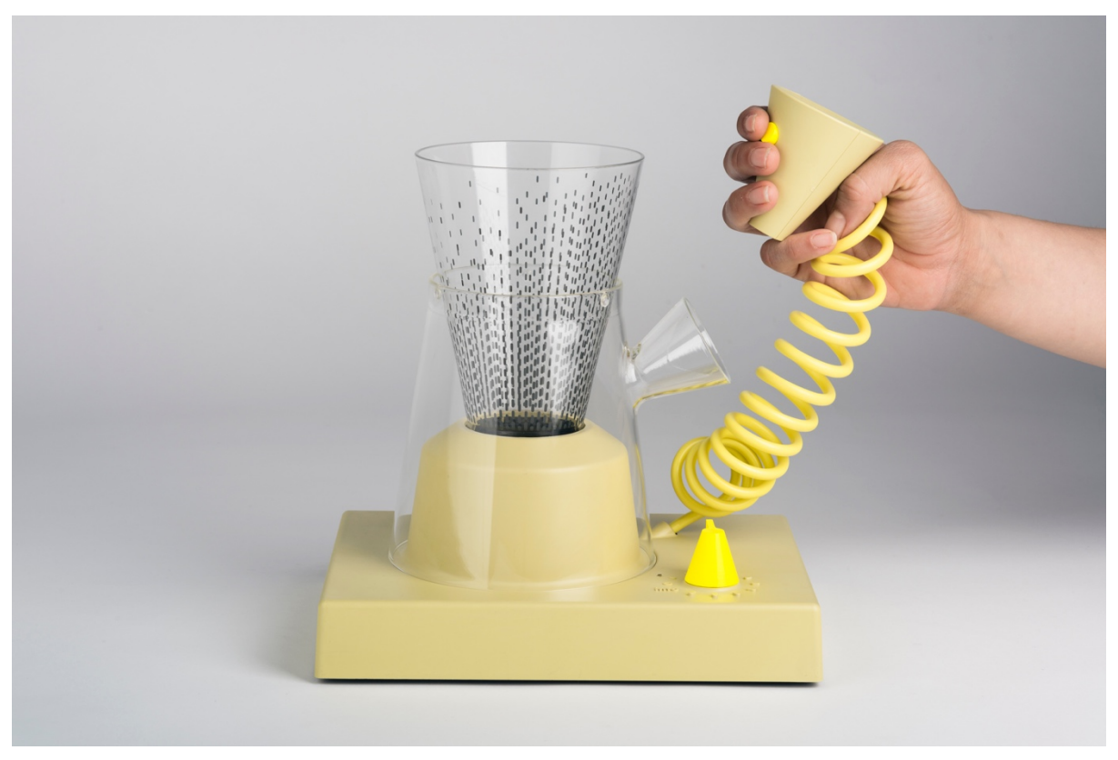
Figure 1: The Energy Babble.

If retroscription involved rendering past situated and collective experiences of using an energy monitor into a visualisation, then procomposition included mobilising the experiences of monitoring-in-use and of demand-related appliances as part of the design and deployment of the Energy Babble (see figure 1 and Gaver et al. 2015) speculative research device. The Energy Babble, a radio-like interactive research device that 'spoke' audible energy and climate related content drawn from the internet, social media, and community member voice messages, deliberately aped generic aspects of smart energy monitor scripts in form and function.