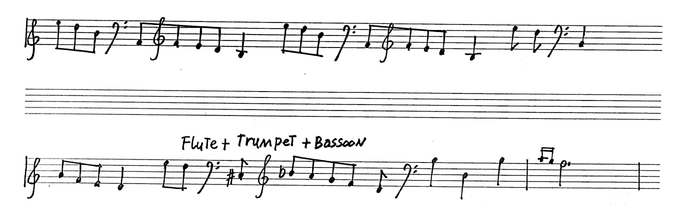
Example 2 . Newman, Song to God , IV: systems 12–3, page 10. © Chris Newman. Multiple changes of clef in this passage preserve the original pitch of the individual fragments.

Although the intended analysis of musical discourse is not possible, a separate observation emerges as a corollary of this situation. The identity of each musical fragment is reinforced not by its place in its original source but by its repetition: each time a fragment appears, visually it is exactly the same. The clef, rhythmic divisions and notations, and absolute pitch of each fragment is always preserved (see Figure 2). Most often, the first instance in which each of these fragments appears is either the first line or the piano introduction of the song with which they are associated. Thus, the exact reference to the source material is always preserved in terms of pitch, clef, and notation: these fragments are not obscured, and nor are they developed beyond their combination with each other in pairs unique to this piece.