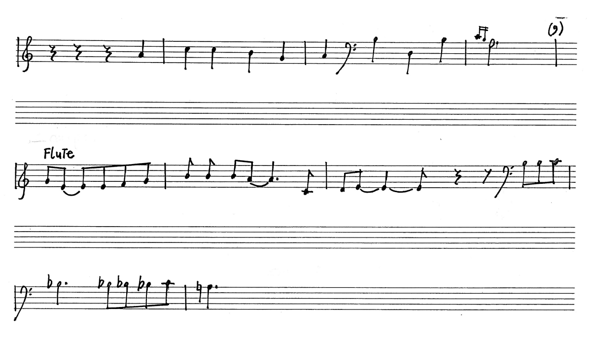
Example 1 : Chris Newman, Song to God (1994), I: systems 7–9, page 2. © Chris Newman. System 7 shows the intended 'breath' or break, otherwise notated by empty space at the end of system 9.

This is an example of the music's visual communication with the performer, as opposed to its aural communication with the listener, holding more in common with works of space-time notation and other variants of visual notation—such as the middle-period works of Morton Feldman9—than it does with more determinately notated works that utilise regularised rhythmic notation. Indeed, the performance practice of Newman's works denies any such flexibility as might be associated with Feldman's works of the late 1960s and '70s. Nevertheless, this indication that the music can be visualised, and that its visual component might provide valuable information concerning its understanding, can be extended to consider the distribution of the music and its relationship with the poietic constriction of the work.