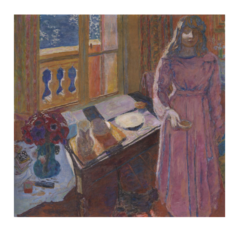
Figure 3. Pierre Bonnard, Le Bol de Lait (The Bowl of Milk) , oil on canvas, 116 x 121 cm, 1919. Tate Modern (© Tate. https://www.tate.org.uk/art/artworks/bonnard-the-bowl-of-milk-t00936)