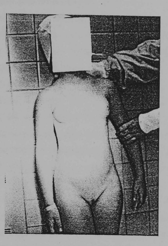
Fig. 6. The presence of normal secondary sexual characteristics and a feminine habitus give no hint that a patient such as the one shown here has agenesis of the vagina and uterus.