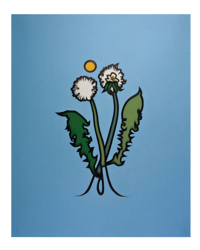
Have that conversation you are dreading

and A Week in Weeds (horoscopes from Burgess Park), 2008 Coloured card, black pencil crayon 65 \times 53 cm each