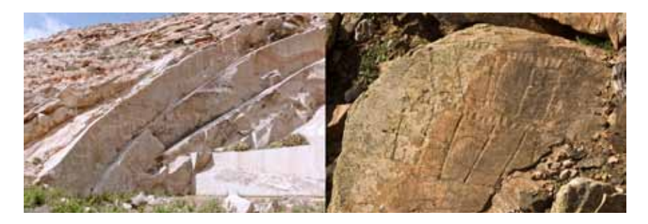
FIGURE 2: Tindaya's quarries and engravings. Left image by the author; right image courtesy of Juan Santana.

born out of the acknowledgment of the need to put an end to this conundrum: a mountain simultaneously protected and exploited within the law.