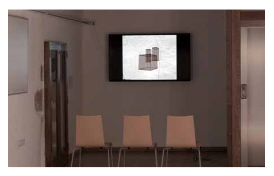
FIGURE 5: Casa Alta Museum exhibition, installation view.

The exhibition's main argument is made explicit in its spatial arrangement and the texts that punctuate it: the Monument is not only compatible with Tindaya's archaeological and natural features, but it "sets the standard for how to act in nature" and "seeks to respect the same phenomena that our ancestors worshipped: the vital relation between the depths of the earth and the sun, the sea, and the moon." Put differently, the Monument is seen to correct the damage done by the quarries by redirecting the rock extraction, while also updating its sacredness by means of a grand contemporary intervention.