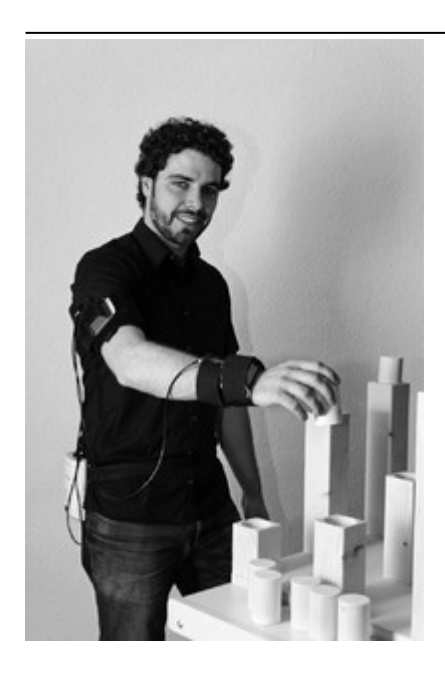
Fig. 31.2 Sonification of arm movements. The device contains a movement sensor applied to the forearm and upper arm (Xsense ^{(R)} ) and allows to transform movements into music coding the vertical axis into pitch, the horizontal axis into timbre, and the z-axis into loudness. This way, the paretic arm is transformed into a simple musical instrument, allowing us to 'move' tunes.

Summarizing effects for the rehabilitation of the upper limb after stroke, music supported training is undoubtedly efficient and seems to be more helpful than functional motor training using no auditory feedback, but otherwise similar fine motor training. With respect to the underlying mechanisms, a number of open questions still remain. First, the role of motivational factors must be clarified. From the patients` informal descriptions of their experience with the music supported training, it appears that this was highly enjoyable and a highlight of their rehabilitation process, regardless of the form of auditory stimulation, be it piano tones, or sonification of movement with other timbres. Thus, as already explored in the first part of this article, motivational and emotional factors might have contributed to the success of the training programme [57].