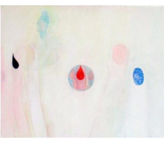
Bluebird, 40×50 cm [Cat, 3]

and definitely other worldly, hinting at the mystical (a somehow uncomfortable word but an apt one nevertheless). In one work two ghostly faces with the pupil-less eyes of classical busts hover amid coloured spheres. Along the lower edge of the painting a miniature motif might evoke the mouth of a cave fringed with greenery - and having gone this far it's easy to start imagining the image having grown out of antique mythology. The faces with their empty eyes and gaping mouths could be masks