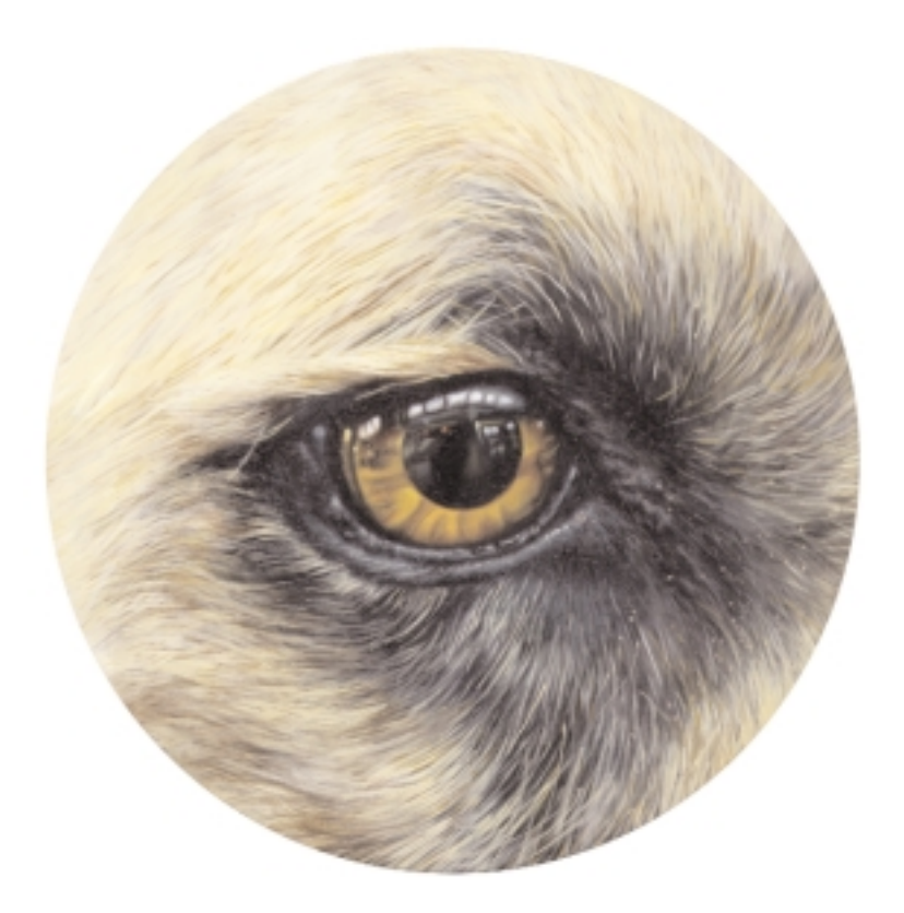
MARK FAIRNINGTON Cape Hunting Dog