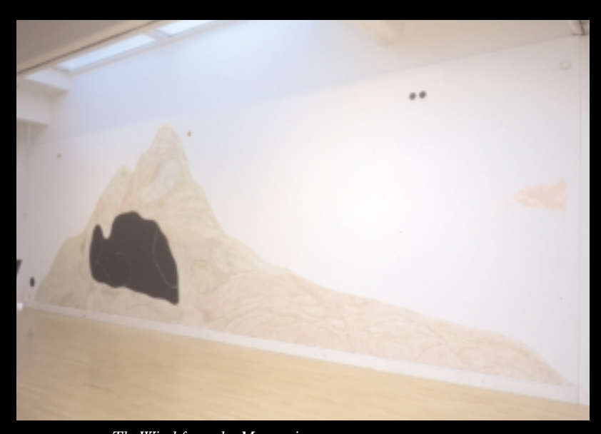
ROXY WALSH The Wind from the Mountains

i said i would walk the pennine way in 14 days but i am now regretting this decision very badly it is now day 5 and i am cut of from all communication i am just past malham, my mobile as no signal i am wet though today hasn't been so bad but for the rest of the week it as been dreadful. i hope to see you all at the library very soon god i miss you but i will keep in touch by the emails oops fell down a hole again ow a wet one the water has come right over my wellies agh missed it there goes another sheep it could have dried out my wellies.i need a drink there a pub i run and run my wellies sloshing from the overflow, was it the water or was it my bladder it could have been either i am getting on a bit.anyways im still running the pub getting closer closer i can smell my timothy taylors that i havent had for 5 days its their im touching it no i shout its a mirage like i had in 1922 fighting in the dessert left all alone even by my comrades maybe then they knew or i knew i was just destined to be alone. A lady walks past it is a figment of my imagination or is it i dont even trust my own mind anymore it was im sure iwalk faster they walk faster im catching. thats where it ends until next time to the further adventures of richieson