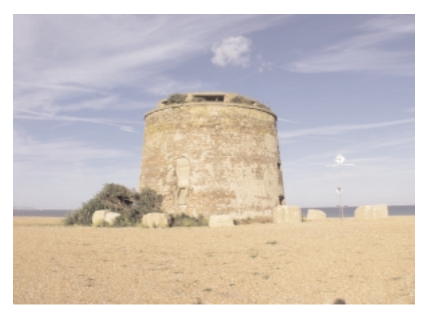
VOLKER EICHELMANN / ROLAND RUST Martello Towers #04

It was the coarseness of this realisation of the day that had unsettled him. He pursed his lips in a vinegary pause: "blues". The word stepped out in front of him, shook itself, and defied him. Till sniffed. He looked away. Now the size of the numerals concerning him. Fifteen feet, three and three eigths inches, in numerals precisely two and three quarter inches high, with always the same constant degree of slope, and always the same character and gravity to them. With each line exactly four inches from the floor, ceiling or proximate wall or door frame, each measurement was exactly two inches above, below, or to the left or right. He had once had a system for this, a set of rules. But these had become ingrained, and now he just knew what to do. He would not like to be called upon to demonstrate his system though, and he did his best not to think of it anymore. Were the numerals too small? No.