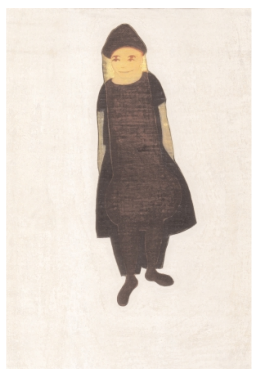
ROXY WALSH Silvertone