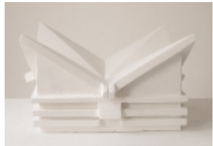
BRIGITTE JURACK Boat House (Liverpool); Covered Market (Kiev)

'It is as fatal as a murder or any other horror that divides people,' he burst out again; 'it is more intolerable – to have our life maimed by petty accidents.'