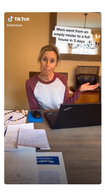
Figure 2. Screenshots of TikTok videos by Mele (@mmmjoemele, 2020), @alexvaa (2020), and @darnbee (2020) for illustration of communal communications.

As these examples outline, social relationships are prominently featured within TikTok content. However, enframed through trends, memes, and shared ways of expression, these contents enable a different kind of relationship to form: that in which strangers can relate to one another in meaningful ways. The significance of the performers as distinct subject positions is overshadowed by that of their participation in a larger cultural event. The communicative form opens grounds for an encounter that is not necessarily concerned with dialogue or debate, but that kind of meaning emerging from sensing the presence of others in what has been theorized as a "contact zone" (Ahmed, 2004)—a surface area enabling the materialization of collective sentiments and sensibilities of the now.