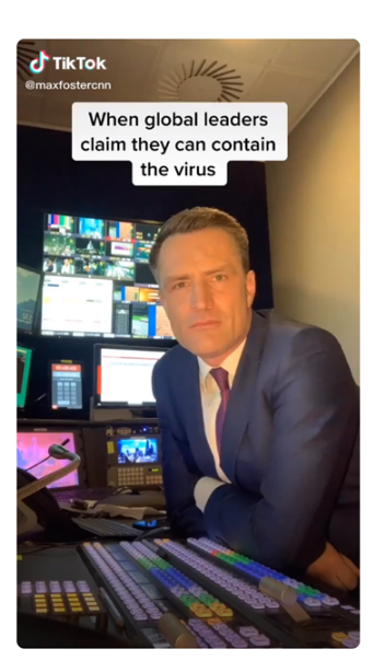
Figure 1. Screenshots illustrating the discussed TikTok creations of @lonnieivv (2020), Ong (@chunkysdead, 2020), and Foster (@maxfostercnn, 2020).