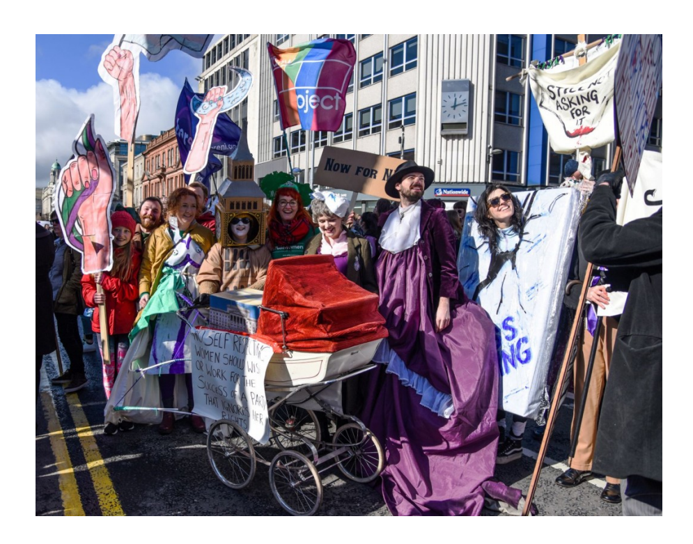
Figure 8. Members of the Turner-shortlisted Array Collective at an event on International Women's Day, 2019.

While distinct in remit, each collective is localised—produced by specific groups determined by a shared sense of location, dislocation, or identity. They serve particular constituencies while also—in moments of visibility such as the Turner Prize—spotlighting under-recognised topics or challenging discrimination or marginalisation. Each group innovates distinct modes of public engagement, providing advisory or technical services beyond the auspices of participatory art. Discourse and activism are embedded within greater schemes of work, schemes that reach for financing beyond art's public funding bodies ailing under Conservative austerity.