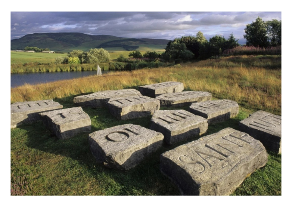
Figure 13. Ian Hamilton Finlay, The Present Order is the Disorder of the Future Saintjust, 1983, carving. Little Sparta, Dunsyre, Scotland.

The Present Order from what feels like the disorder of the future, the ambiguities of Hamilton Finlay's work allow it to be either a consolation or a bittersweet manifesto. It behaves like a ruin battered by time, but all except thirty years of that age is an illusion, a fiction like nationhood itself, and like the future Saint-Just imagined.