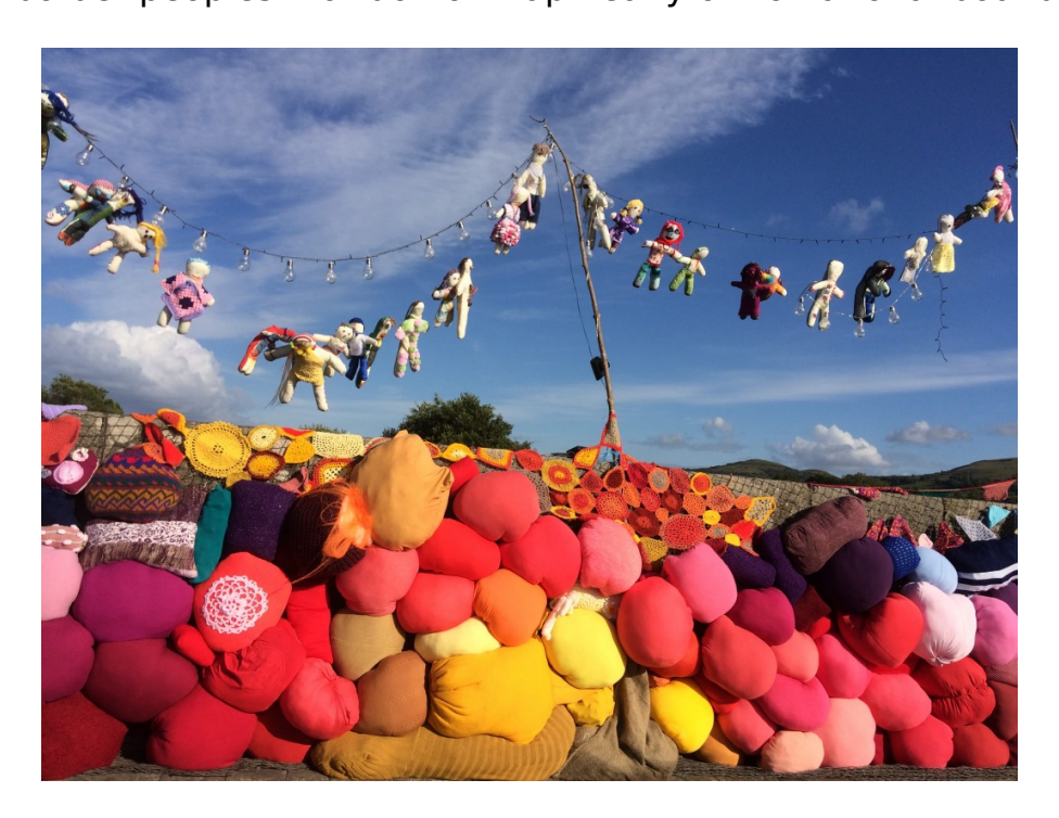
Figure 9. Rita Duffy, Soften the Border, 2017, installation on Blacklion-Belcoo bridge, dimensions variable.

In 2017, the Northern Irish artist Rita Duffy collaborated with Catholic and Protestant women living on either side of the Irish border to create Soften the Border , an installation that straddled the geopolitical line running through Belcoo-Blacklion Bridge between County Fermanagh in the United Kingdom and County Cavan in Ireland (Fig. 9). A series of knitted orbs, votive dolls, and disembodied cats' heads were exhibited over the River Belcoo. Duffy worked with cross-community groups set up with European Union peace funding after 1998; the artwork is a testament to the links and bonds between border peoples that do not map neatly on to national boundaries.