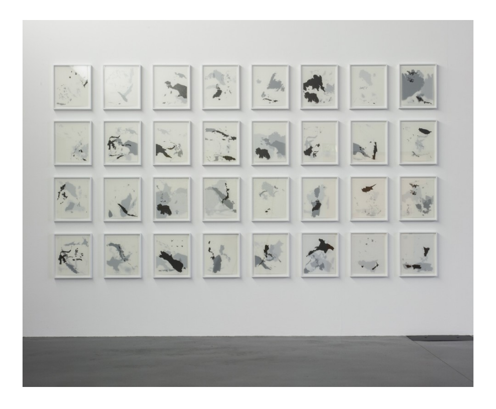
Figure 4. Tania Kovats, All the Islands of All the Seas, 2016, ink on layered matte acetate, 196 drawings, 32 parts, framed, 42 x 30 cm. Pippy Houldsworth Gallery.

The label "island writers" is often used to identify a body of postcolonial writing from former British colonies in Caribbean, Indian, and Pacific archipelagos. These writers (including the St Lucian poet Derek Walcott) "have rendered island spaces as vital and dynamic loci of cultural and material exchange". <sup>15</sup> As a series of small nations connected by the sea, they have profited from fluid, transcultural, diasporic, and regional alliances. Martiniquan writer Edouard Glissant has described the "openness" embodied by these islands: "the dialectic between inside and outside is reflected in the relationship between land and sea". <sup>16</sup> For Kovats, Hartley and other contemporary British artists (including, for example, Simon Faithful and Tacita Dean), the sea is vital to the spatial scale of island imagination, enabling my parallel designation of "island artists". In their work, the sea can act as a metaphor of connectivity within and beyond archipelagos. It can defy colonial and pro-Brexit narratives of separate island status and affirm the important role of art in the United Kingdom's "struggle with plurals".