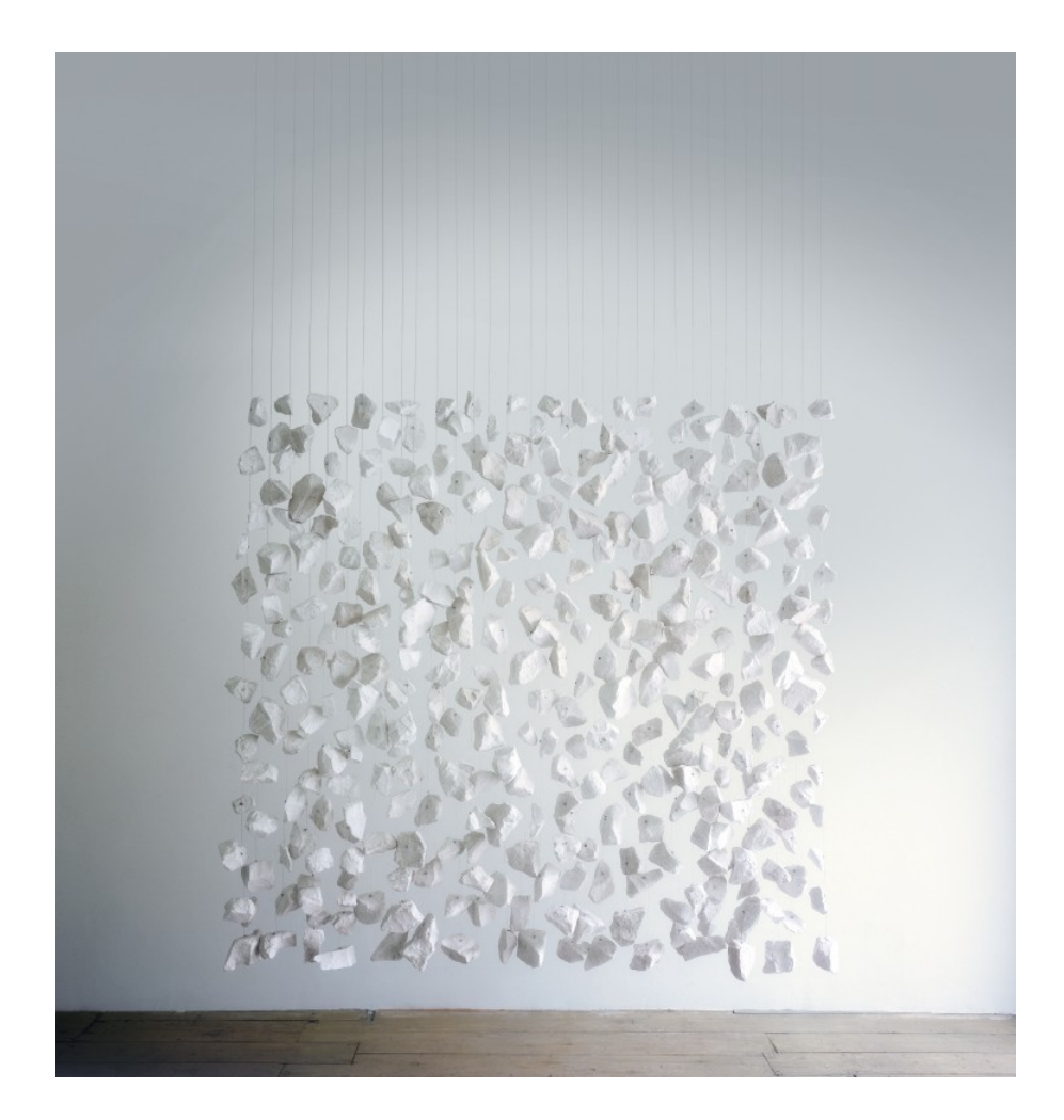
Figure 1. Cornelia Parker, A Side of England, 1999, chalk retrieved from a cliff fall at Beachy Head, South Coast, England, wire, and mesh.

We are "in" rather than "after" Brexit. Behind the theatre of the UK's withdrawal from the European Union, many important mechanisms of collaboration in the arts have been, or are in the process of being, dismantled. Although much remains uncertain, immediate realities include the loss of around £40 million of EU arts funding per year, the UK's withdrawal from the Erasmus scheme, and more complicated restrictions on moving, working, buying, and selling, between the UK and EU member states. <sup>5</sup> If the UK becomes an expensive and prohibitive place to study, if access to EU research funding is not replaced, and if cultural institutions begin to see cross-Channel collaboration as a risk not worth taking, will these logistical borders be replicated in the future of how we understand art in Britain?