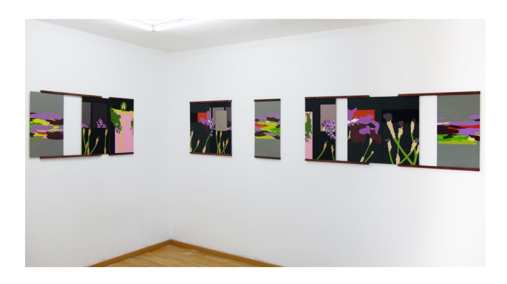
Figure 3. Anna Rossi, Espace Vert (Green Spaces), one of 52 panels (installation view), 2021, acrylic on wood panels, on rails, 12.5 x 23.5 in panels.

Equally, the consequences of Brexit have become almost inextricably tangled with the impact of the COVID-19 crisis, doubly tying up and suspending vital flows of cultural exchange. It is almost impossible to predict what restrictions will remain in place after the health crisis has passed. The pandemic-related restrictions are thus superimposed on the consequences of Brexit, forming a calcified and contradictory conjuncture: on the one hand, the hardening of nationalist ideology; on the other, a virus which knows no frontiers.