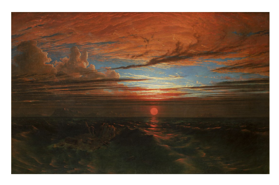
Figure 2. Francis Danby, Sunset at Sea After a Storm, 1824, oil on canvas, 89.6 x 142.9 cm. Collection of Bristol Museum and Art Gallery (K5008).

With these words, the Mayor of Bordeaux, Pierre Hurmic, introduces the sumptuous exhibition catalogue Absolutely Bizarre! Les drôles d'histoires de l'Ecole de Bristol (1800–1840) . The exhibition, which opened on 10 June 2021 and showcases eighty works by nineteenth-century artists including Francis Danby, Edward Bird, and Rolinda Sharples, has taken nearly five years to prepare (Fig. 2). It is a collaboration between the Musée des Beaux-Arts de Bordeaux, the Louvre, Paris, and Bristol Museum & Art Gallery, with additional loans from the Victoria Art Gallery in Bath and Tate. Work on this international project started just a few months after the Brexit referendum and successfully bridged the transition period and the final departure of the UK from the EU.