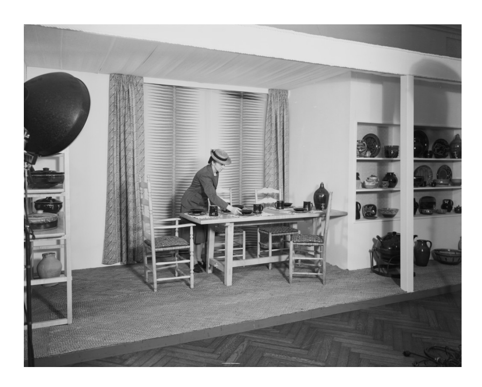
Figure 11. Muriel Rose Adjusts the Country Dining Room Installation at the Modern British Crafts exhibition, Metropolitan Museum of Art, New York, 21 May–19 July 1942, June 1945 , photograph.

As much as Modern British Crafts seemed to affirm the stability of national culture—displaying "jugs in traditional English shapes" and asserting that British crafts had not "greatly changed in character and quality" since opus anglicanum—it also demonstrated how dependent that culture was on international relationships. ^{61} Far from strengthening the supposedly unchanging national craft tradition, isolation left British craft struggling to survive. All but a handful of the exhibits had been produced before the war. Craftspeople were redeployed to war work; materials were impossible to obtain because they were being used to make weapons or they could no longer be imported; craft galleries were forced to close; and, even for those few who could continue to practice, the market for their work had shrunk. ^{62} British craft needed peace to thrive and it needed international consumers to make it sustainable.