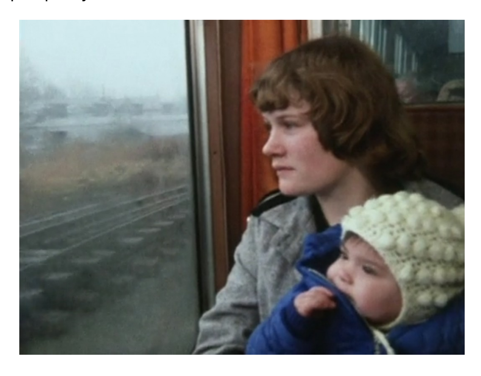
Figure 6. Clio Barnard, The Arbor, 2010, film still.

If the nation is a fiction made real by psychic investments in images of its cohesion, then Brexit exposes what people who have been subjected to Britain's imperial forays into the continents designated "dark" have known all along: the image of England coheres around whiteness. Clio Barnard's film The Arbor (2010) evokes some of the conditions that gave rise to the racism expressed and fueled by Brexit (Fig. 6). Funded by Artangel, which supports artwork that defies the boundaries of genre, The Arbor tells the story of Andrea Dunbar, a young white woman who lived, wrote, and died—prematurely, at the age of 29—on the Buttershaw estate, the notorious housing project in Bradford. Encouraged by a teacher, Dunbar garnered recognition for her skills as a playwright, as she represented the despair of England's post-industrial wasteland with insightful accuracy. Building on Dunbar's plays, Barnard's film attests to the compounded destruction brought about not by foreigners but by a culture of neglect justified by the neoliberal premise that people and places can be abandoned in the name of capitalist prosperity.