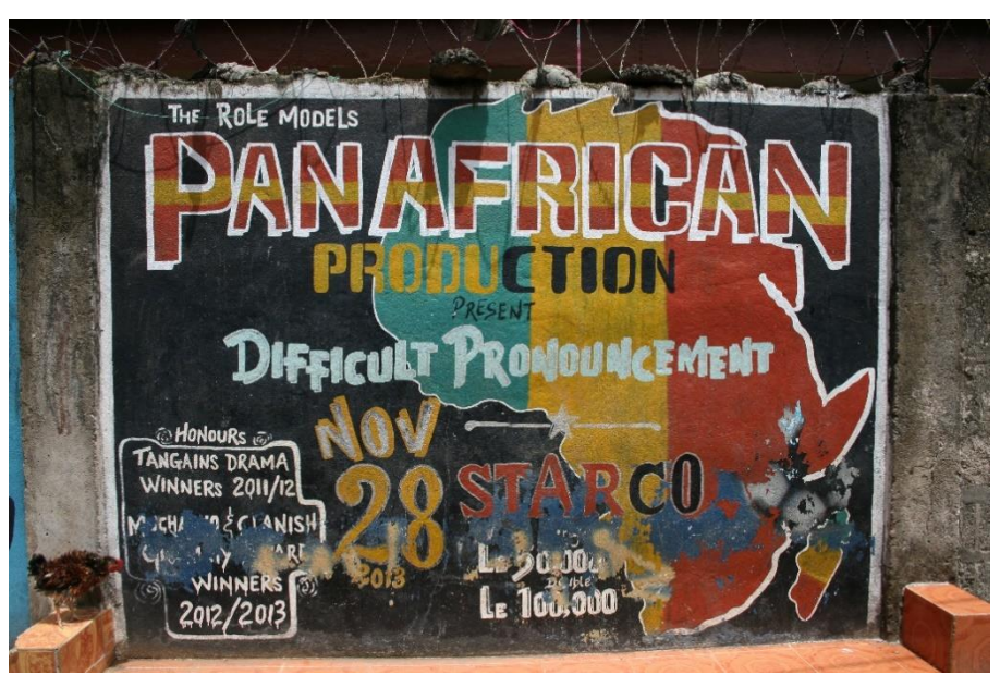
Figure 6: Advertisement for a Pan African Production in East Freetown

At the time of writing one of the more prolific groups in the East is Pan African Productions, who have around 30 part-time members and produce both live performances and videos, which are often not just advertised via banners and flyers, but also murals (as in Figure 6 below).