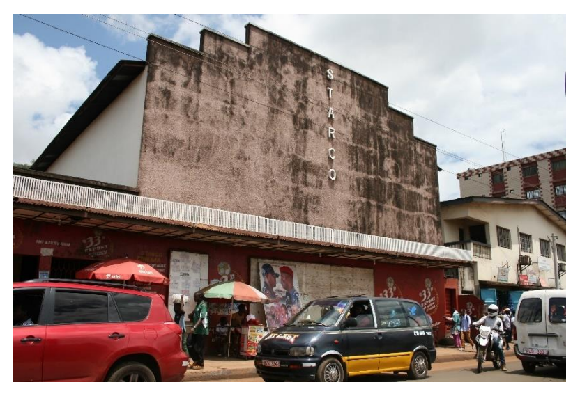
Figure 3: Starco Hall, East Freetown, outside in 2016