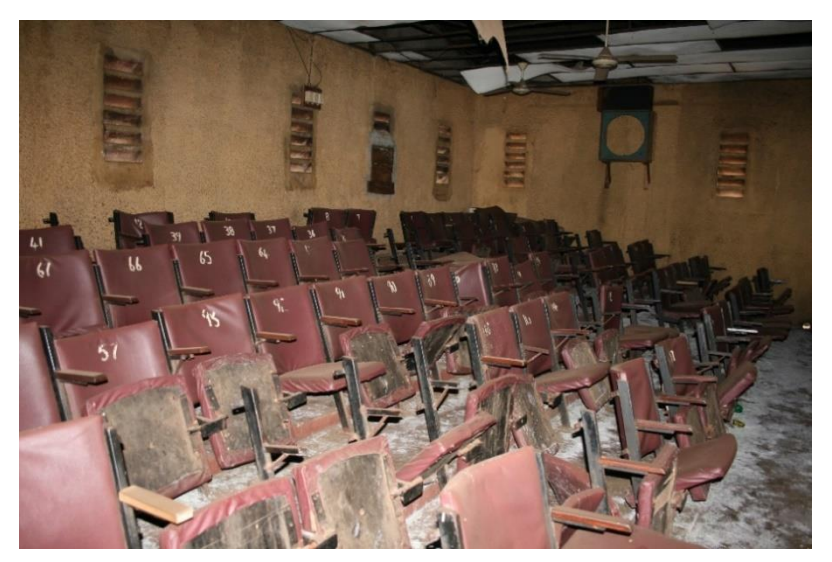
Figure 5: Starco Hall, East Freetown, run-down VIP Lounge on the balcony in 2016