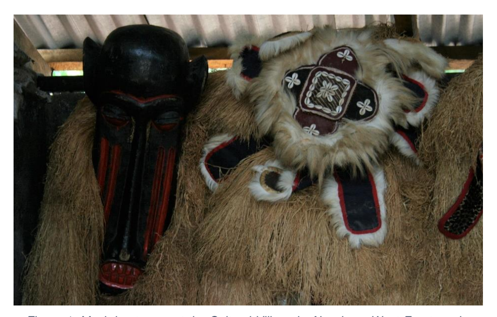
Figure 1: Mask in storage at the Cultural Village in Aberdeen, West Freetown in 2016

heritage, or even at political rallies. Masquerades in particular have become commodified and also serve as tourist attractions, and certain masks can be bought at local markets. Images of 'masked devils' (such as in Figure 1 below) also often appear in tourism brochures and murals (Basu and Zetterstrom-Sharp, 2015). These blurred lines between sacred and secular indigenous performances are another interesting illustration of the hybridisation of the two publics and its implications for cultural life in Sierra Leone.