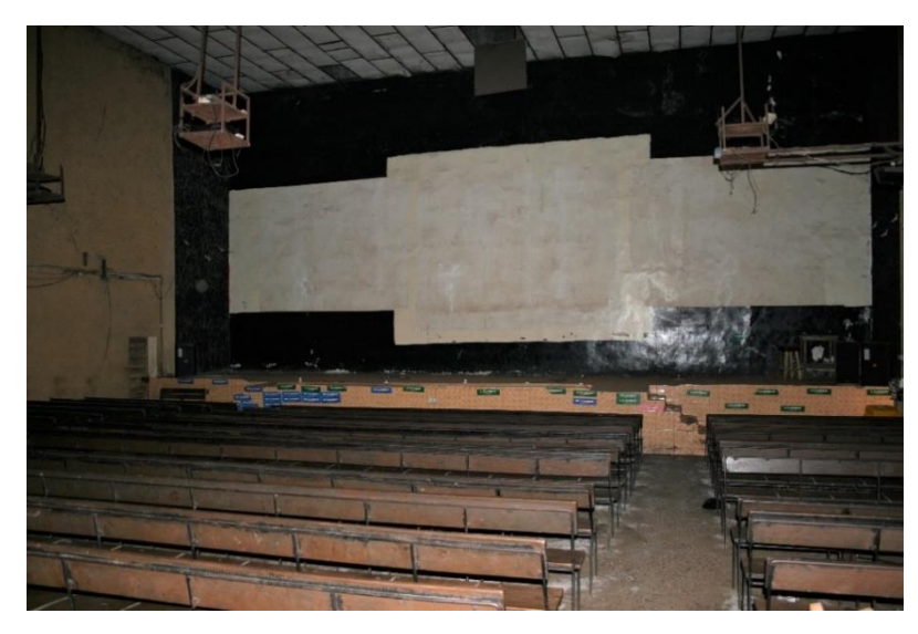
Figure 4: Starco Hall, East Freetown, inside in 2016