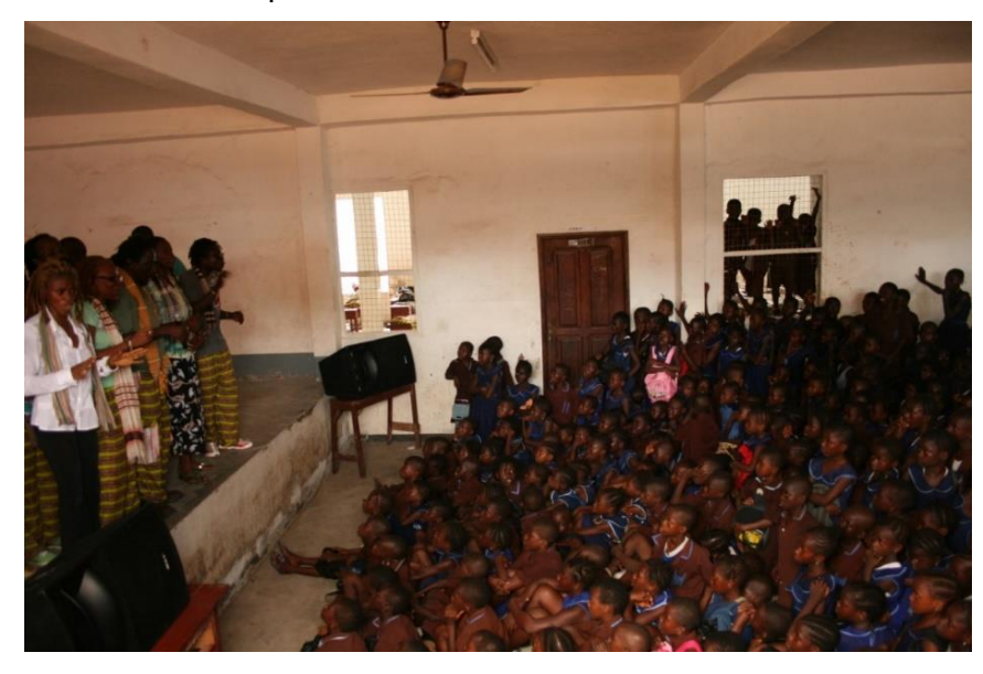
Figure 7: The Freetong Players International performing in a school in 2011

As mentioned above, the Freetong Players International are currently the only full-time professional theatre group in Sierra Leone and beside their more recent community and developmental theatre work for NGOs and development agencies (which mainly allows them to survive), they frequently also perform in schools, both to entertain and educate. Figure 7 below shows one of their school performances in 2011.