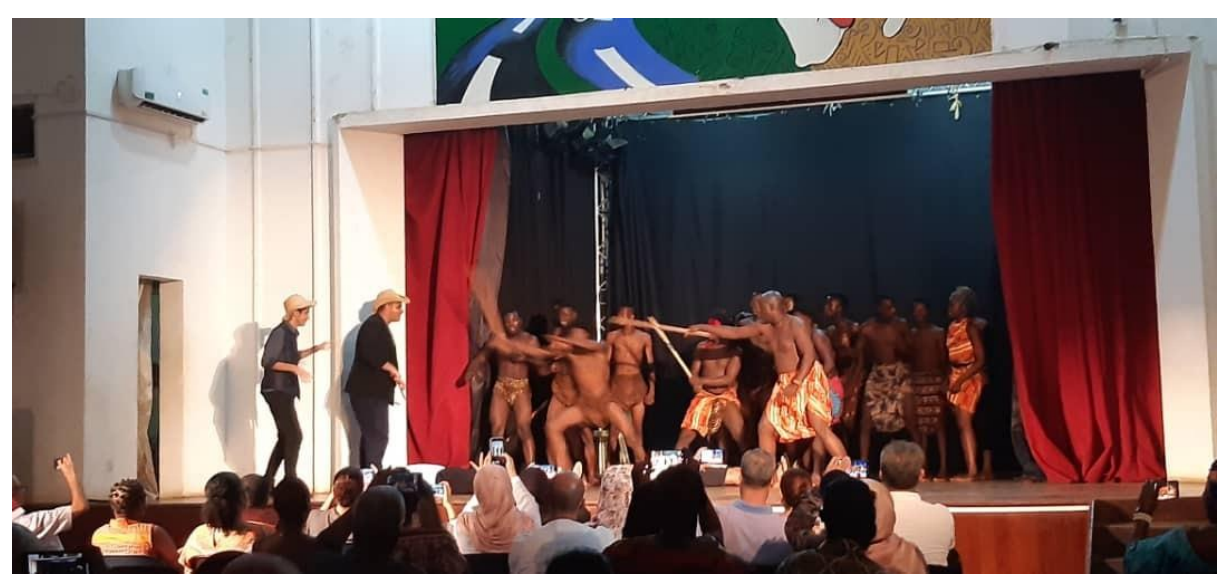
Figure 8: Performance of Amistad Kata-Kata in 2019 at the British Council's auditorium in Freetown

One of Charlie Haffner's other recent large projects is a substantial theatre and documentary film project ( Sing, Freetown ) with the producer Sorious Samura (whose Emmywinning documentary Cry Freetown captured the horrors of the Sierra Leonean civil war). Sing, Freetown , due to be released in June 2021, follows Charlie Haffner as he prepares and stages an ambitious new play, looking in depth into the country's history and its implications for a way forward for the nation; an epic about Sierra Leone to tell a different story and counter the stereotypical images and narratives about the country from without, especially after the civil war and Ebola.