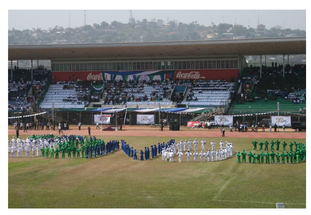
Figure 10: Performance at the National Stadium in Freetown in 2011 (funded by the government) on the occasion of the 50th anniversary of Sierra Leone's Independence Day

The patronage of the arts for branding purposes by political parties has a long history in Sierra Leone. According to Nunley (1985), party symbols, such as those of the APC and the SLPP, were already used in the 1960s for the decoration of lanterns during the popular Lantern Festival described in Chapter 3. Nunley also suggests that both the rise of the APC itself and the subsequent introduction of the one-party state in 1978 were supported by the APC's patronage of lantern-building groups and masquerade societies and their ability to mobilise followers (Nunley, 1985). Today, political parties still offer occasional ad-hoc support for certain cultural representations and events, mainly for displays of 'national culture' and folklore; for example, at festivals, on occasions of nation-wide celebrations (such as the country's Independence Day, as in the Figures 10 and 11 below) or for 'political cheerleading' as part of their political campaigns before elections. In this context culture is thus mainly instrumentalised to further a political agenda, in the sense of promoting institutional legitimacy or a certain type of propaganda. This kind of support, however, does not feed into the sustainable growth of artistic and creative practices, cultural organisations, or the ecology of culture more broadly.