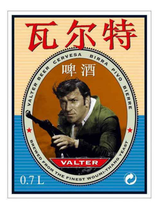
Figure 2. Beer.

deserves a separate study, which would usefully reveal the degree and quality of cultural exchanges that went on between film industries in the East and those in the West during the 1970s (new research is being conducted on this front and merits further study beyond this paper, see Wu 2018).