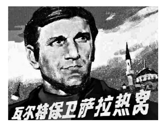
Figure 1. Poster.

His figure as national hero in these off-screen materials is directly dictated by codes of the Yugoslav war film: the posters feature him with a stern expression, in military uniform, brandishing a weapon, while the partisan cap and communist slogans indicate the Partisan specificity of this war iconography. The reason for his immense popular appeal in China