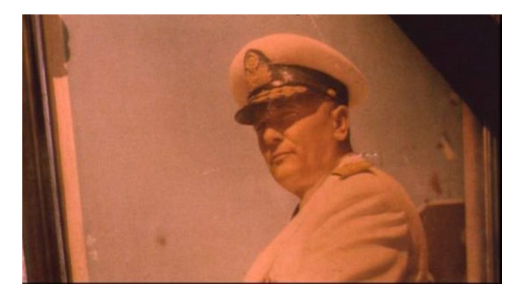
Figure 3. Portrait of Josip Broz Tito.

The last on-screen moments of Bata comprise him carrying Tito's picture as he runs 350 km on foot to his funeral (See Figures 3, 4). This can indicate a final nod to Partisan cinema: Bata bears his trademark partisan cap, dressed in military uniform, as he must