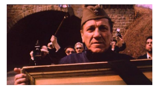
Figure 4. Velimir Bata Živojinović.