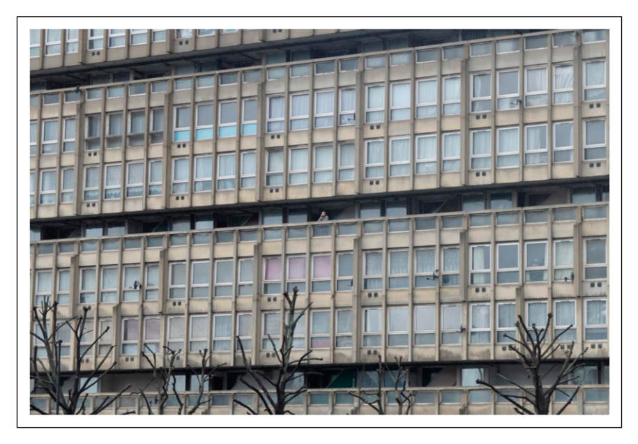
Figure 1. 'Streets in the sky' at Robin Hood Gardens, photo by Robert Deakin, February 2020.

substituting for the views of London's former docklands more familiar to former residents of the estate (Figure 1).