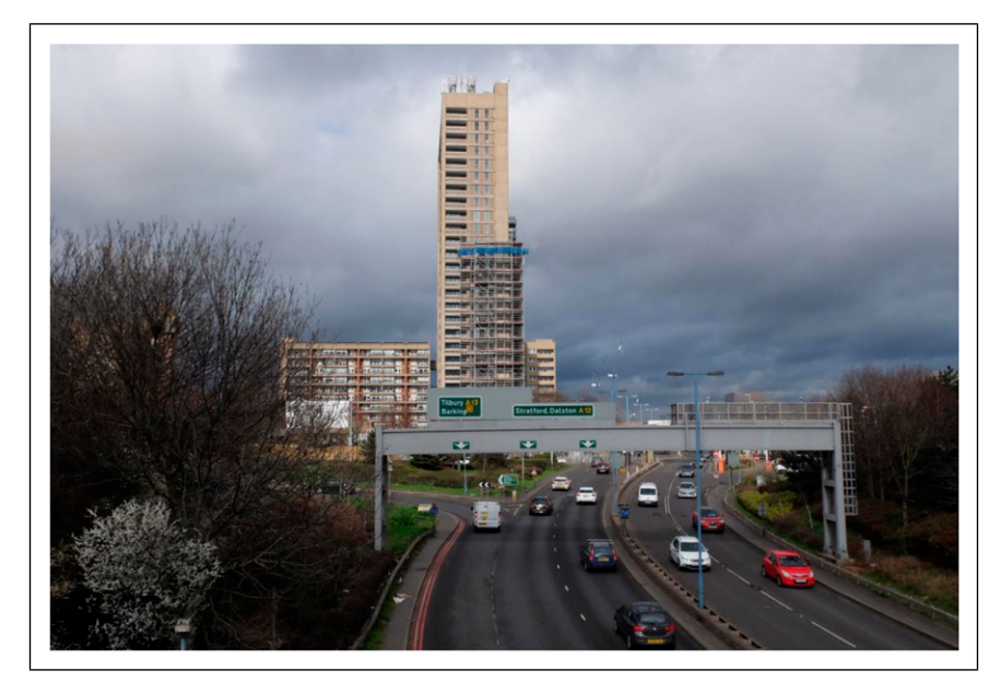
Figure 2. Balfron Tower undergoing refurbishment.