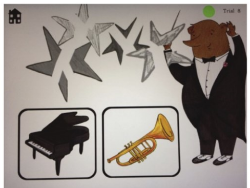
Figure 1. Positive and negative feedback from the TimbreApp melodic priming paradigm.

Language screening test. A Language screening test (British Picture Vocabulary Scale; Dunn, Whetton, & Burley, 1997) was administered to all participants with the aim of determining whether they possessed an adequate level of English language understanding. Age equivalent standardized scores were used in subsequent analyses.